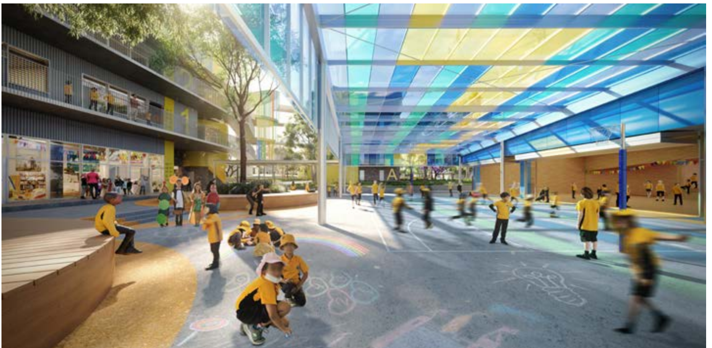
Artist impression of the covered outdoor learning area (COLA)

The project scope and design will continue to evolve during future design phases as feedback from government agencies, stakeholders and the community is considered. The images above are subject to change.