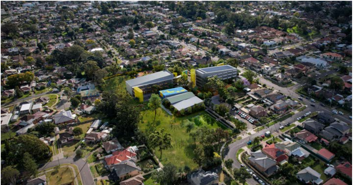
Artist impression showing an aerial view of the new school buildings