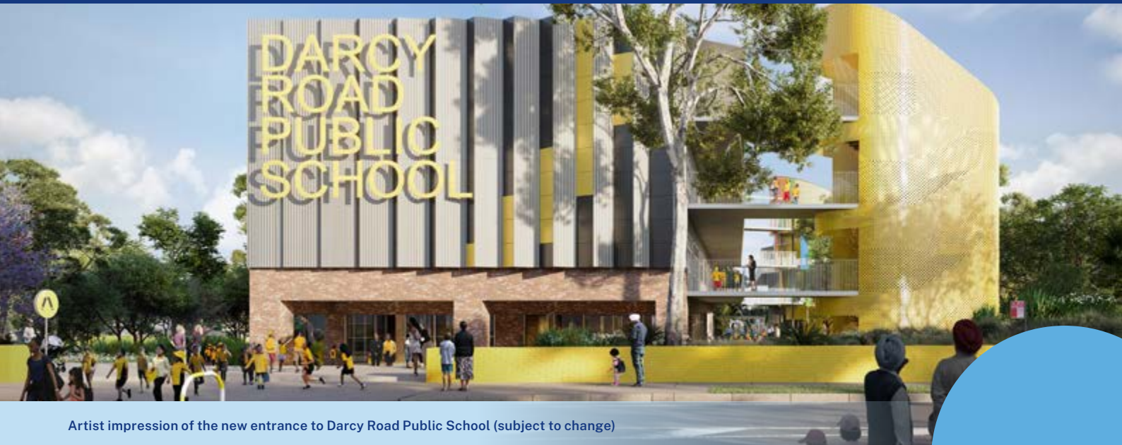
Artist impression of the new entrance to Darcy Road Public School (subject to change)