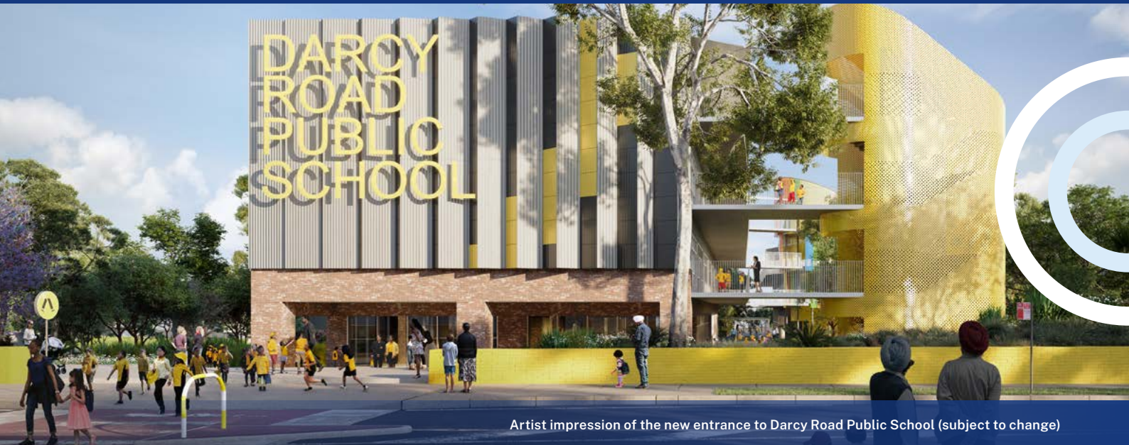
Artist impression of the new entrance to Darcy Road Public School (subject to change)