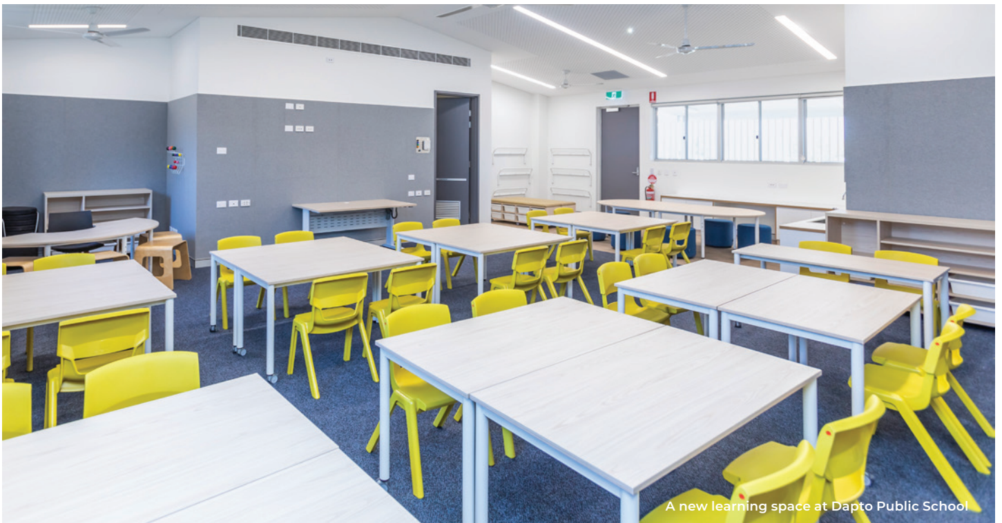
A new learning space at Dapto Public School