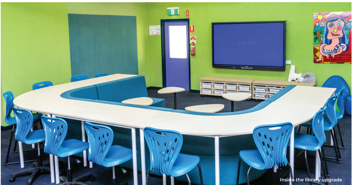
Inside the library upgrade