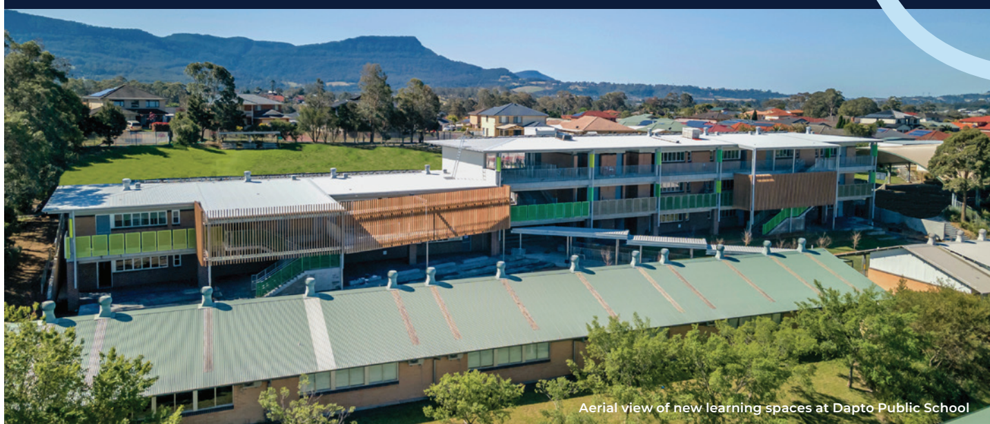
Aerial view of new learning spaces at Dapto Public School