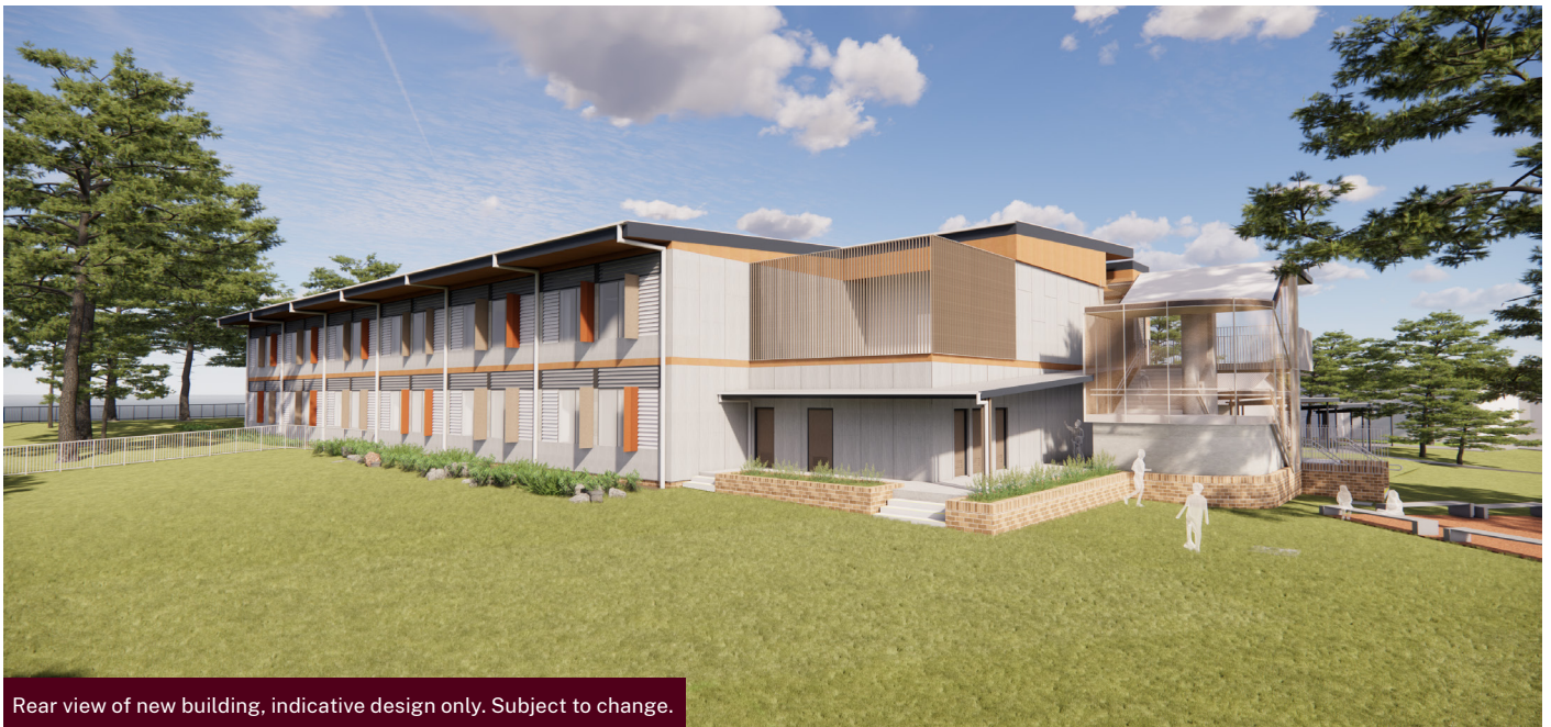
Rear view of new building, indicative design only. Subject to change.