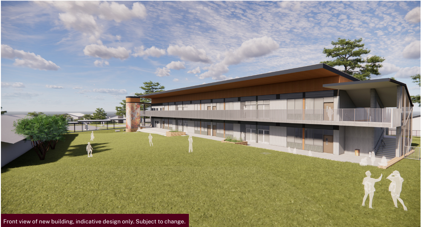
Front view of new building, indicative design only. Subject to change.

We will continue to work on the design for the new building. This will include consultation with school representatives to ensure classroom layouts support the specific teaching and learning requirements for Dalmeny Public School.