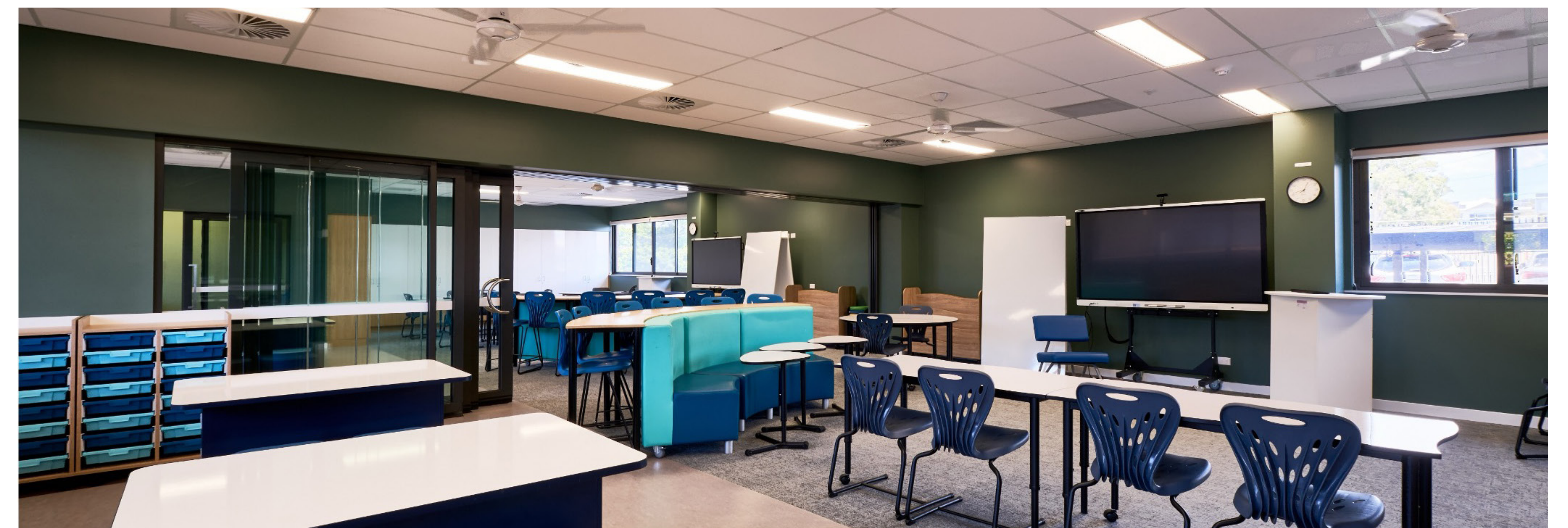
Examples of new modern public school classrooms