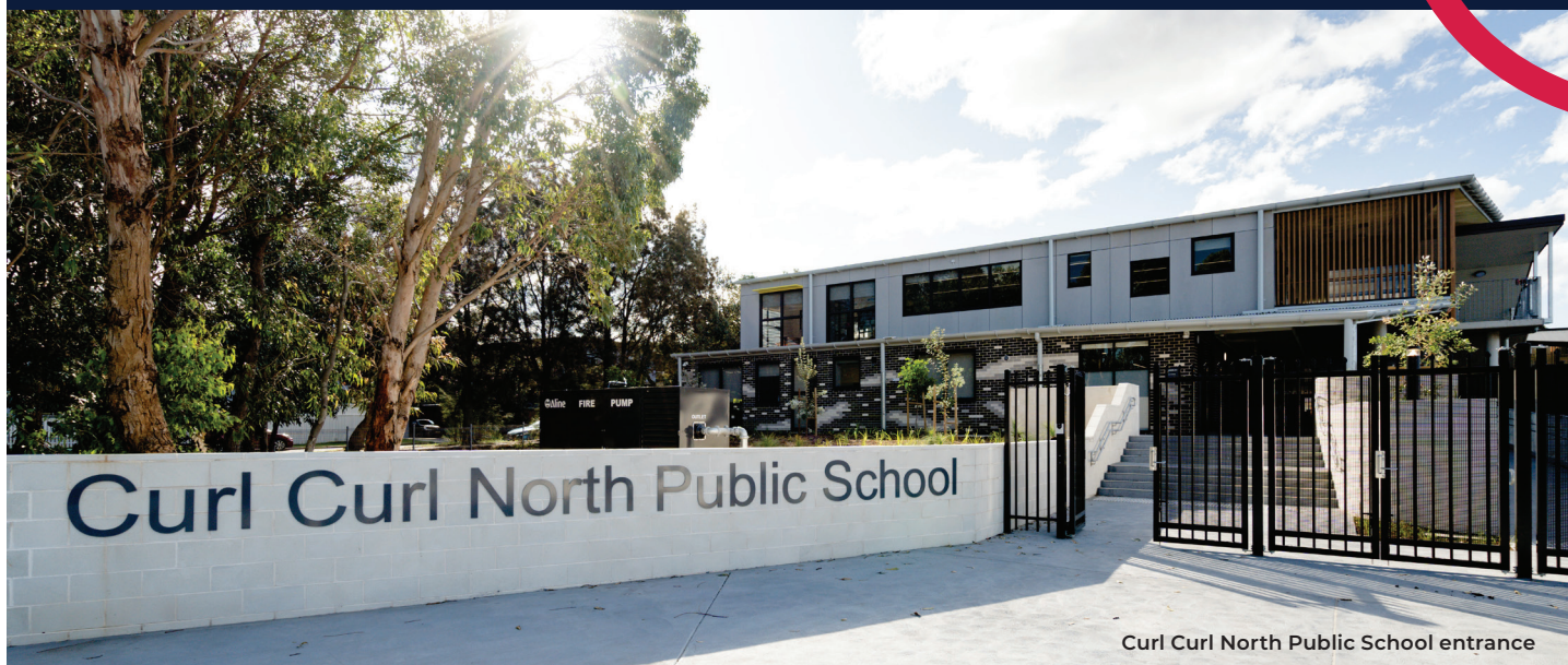
Curl Curl North Public School entrance