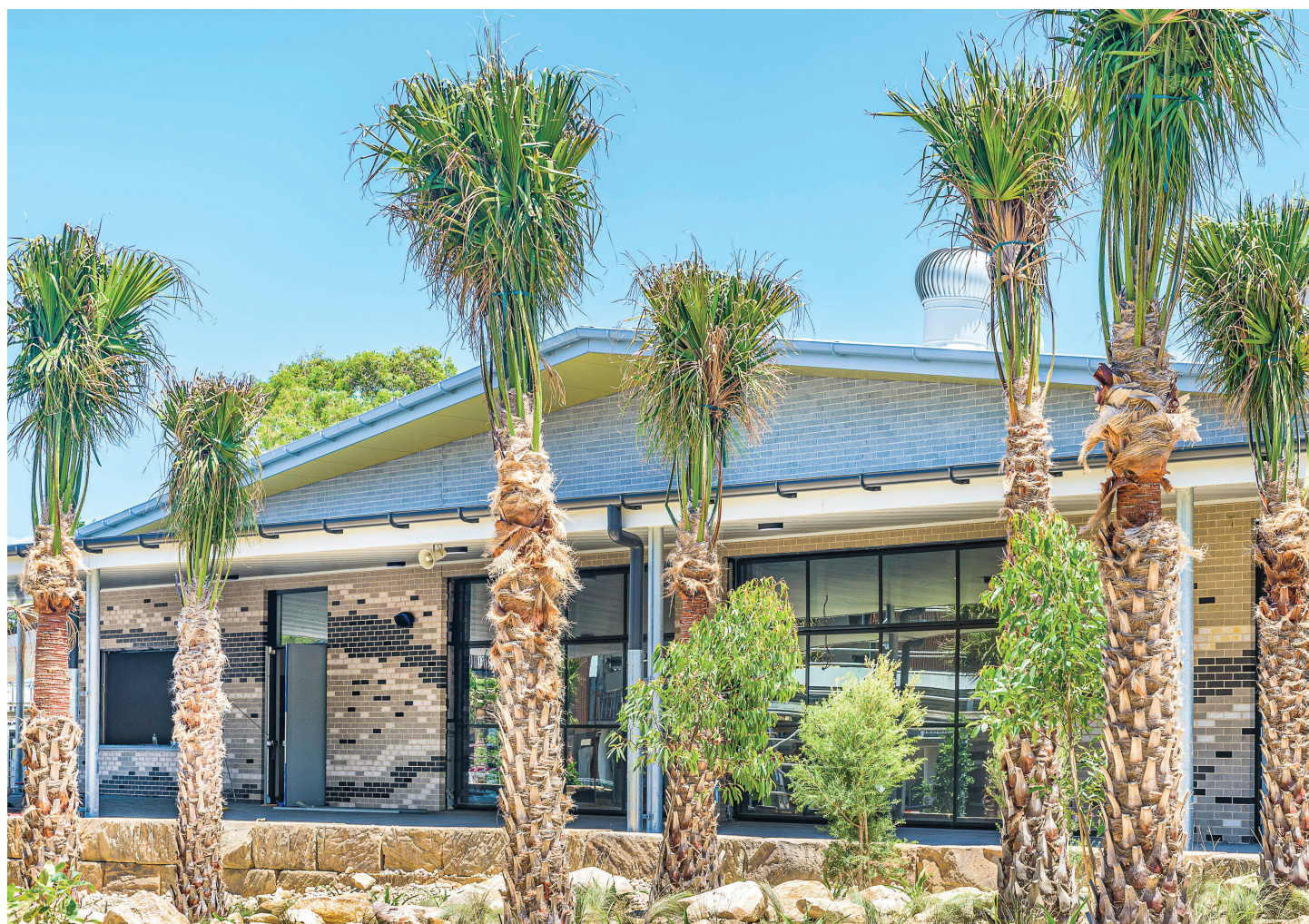
The new hall at Curl Curl North Public School