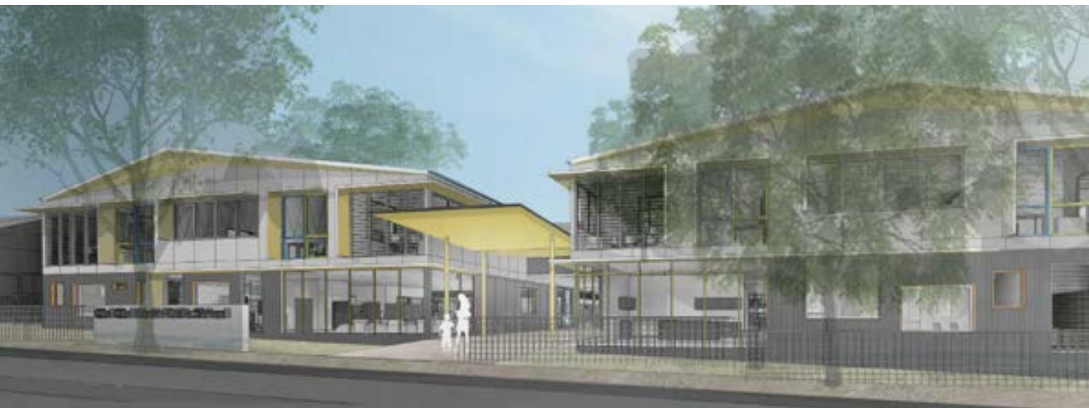
Artist's impression of upgraded Curl Curl North Public School

Construction is due to start in early 2019 on the Curl Curl North Public School upgrade. The project will deliver new facilities and innovative learning spaces.