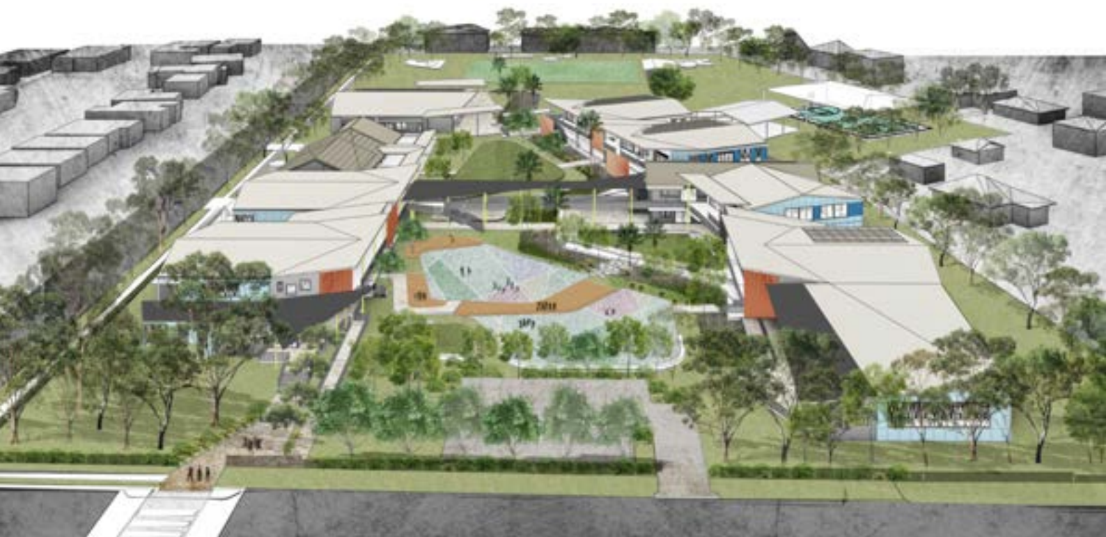
Artist's impression of aerial view of upgraded Curl Curl North Public School