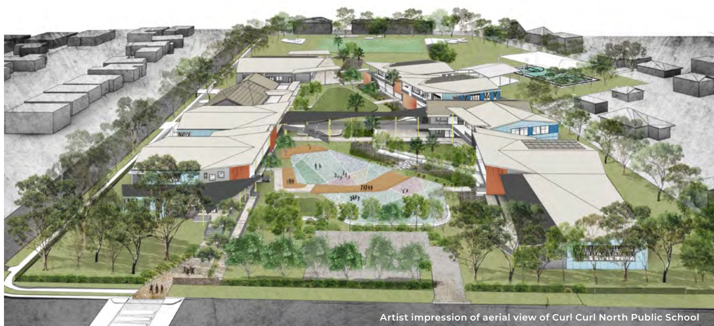
Artist impression of aerial view of Curl Curl North Public School