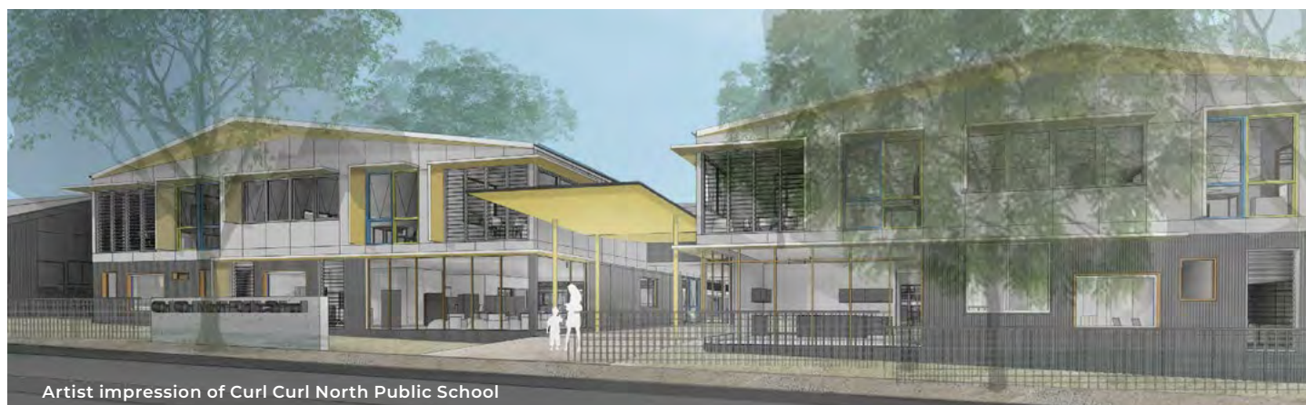
Artist impression of Curl Curl North Public School