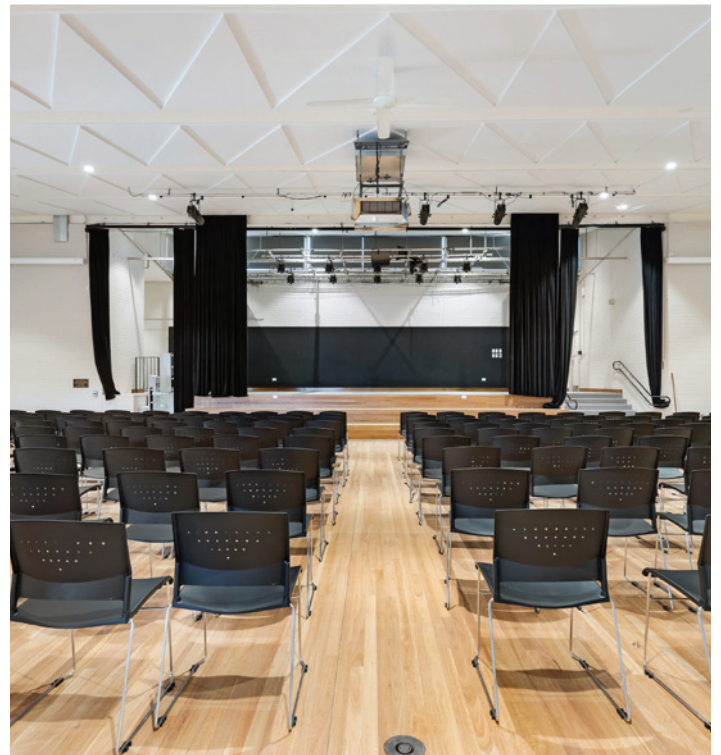
Upgraded school hall