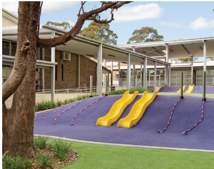
New outdoor play area