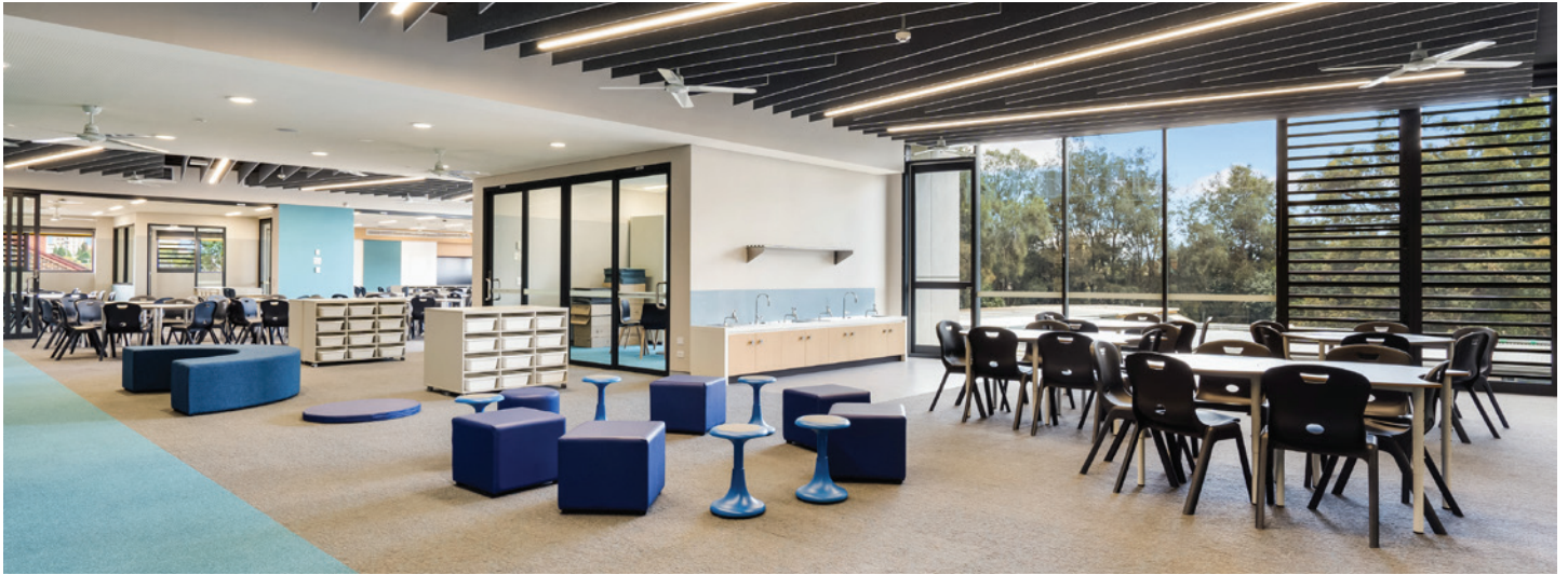
New flexible learning space