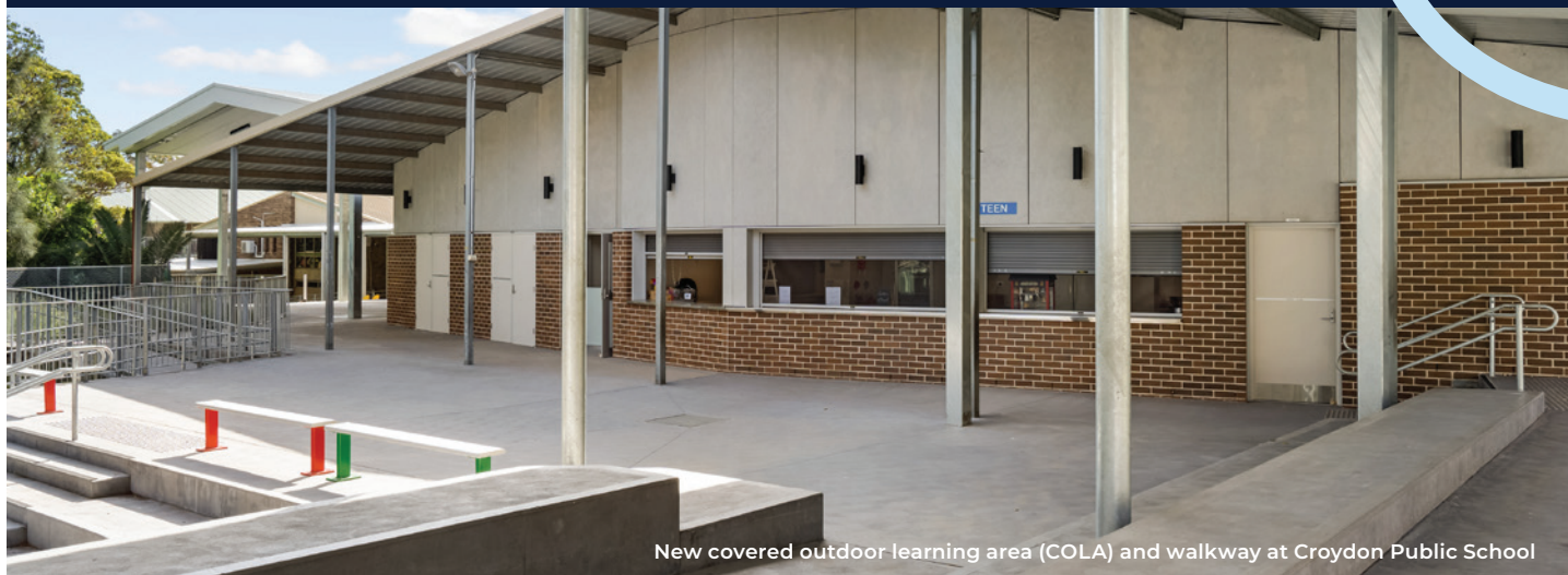
New covered outdoor learning area (COLA) and walkway at Croydon Public School