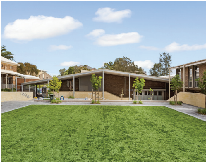
The new Town Square outdoor area

Enhanced outdoor spaces offer new areas for outdoor learning and play to challenge and inspire students. Walkways throughout the school have been upgraded to ensure accessibility for the entire school community.