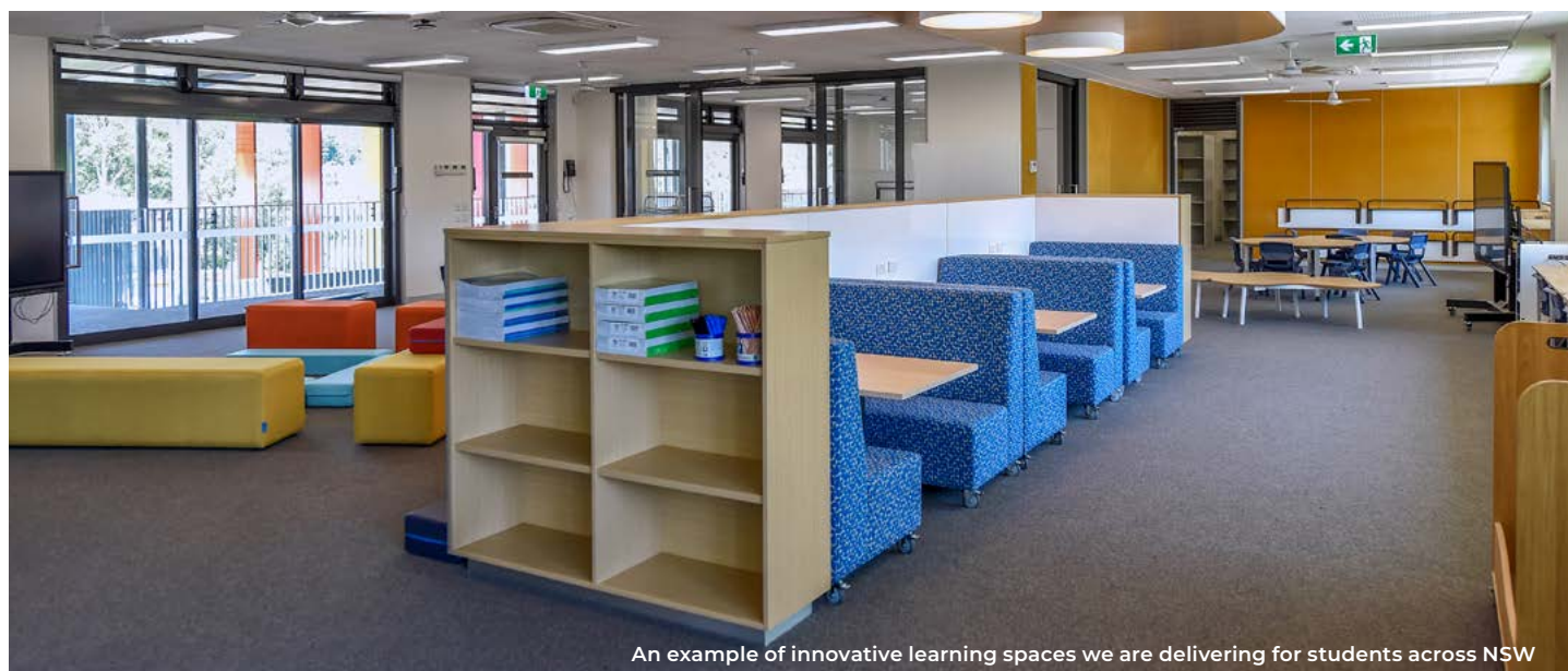
An example of innovative learning spaces we are delivering for students across NSW