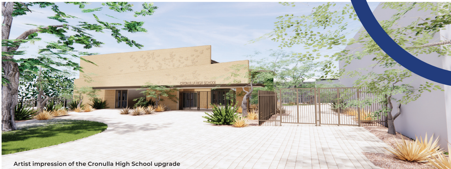
Artist impression of the Cronulla High School upgrade