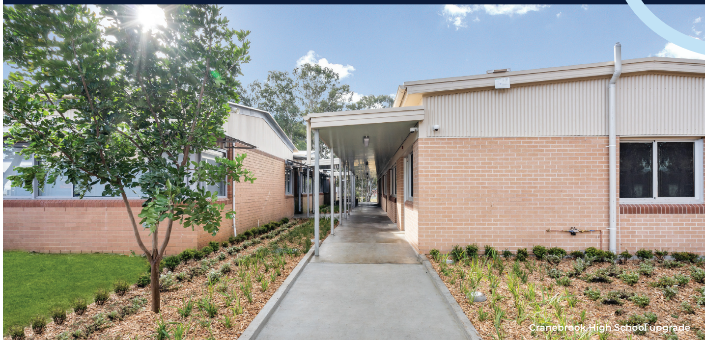
Cranebrook High School upgrade