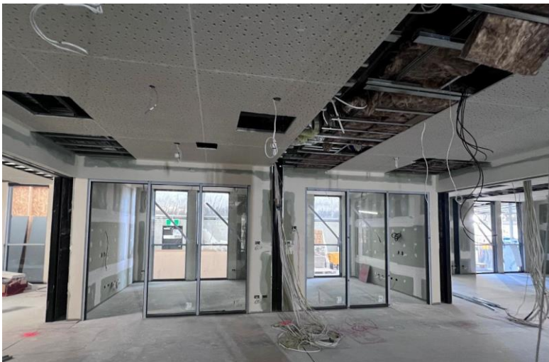
Caption 1&2 : Classrooms in the Condong Public School building

We are expecting to complete the new flood resilient Condong Public School in late 2025, weather permitting, and look forward to celebrating the day with students, staff and the local community.