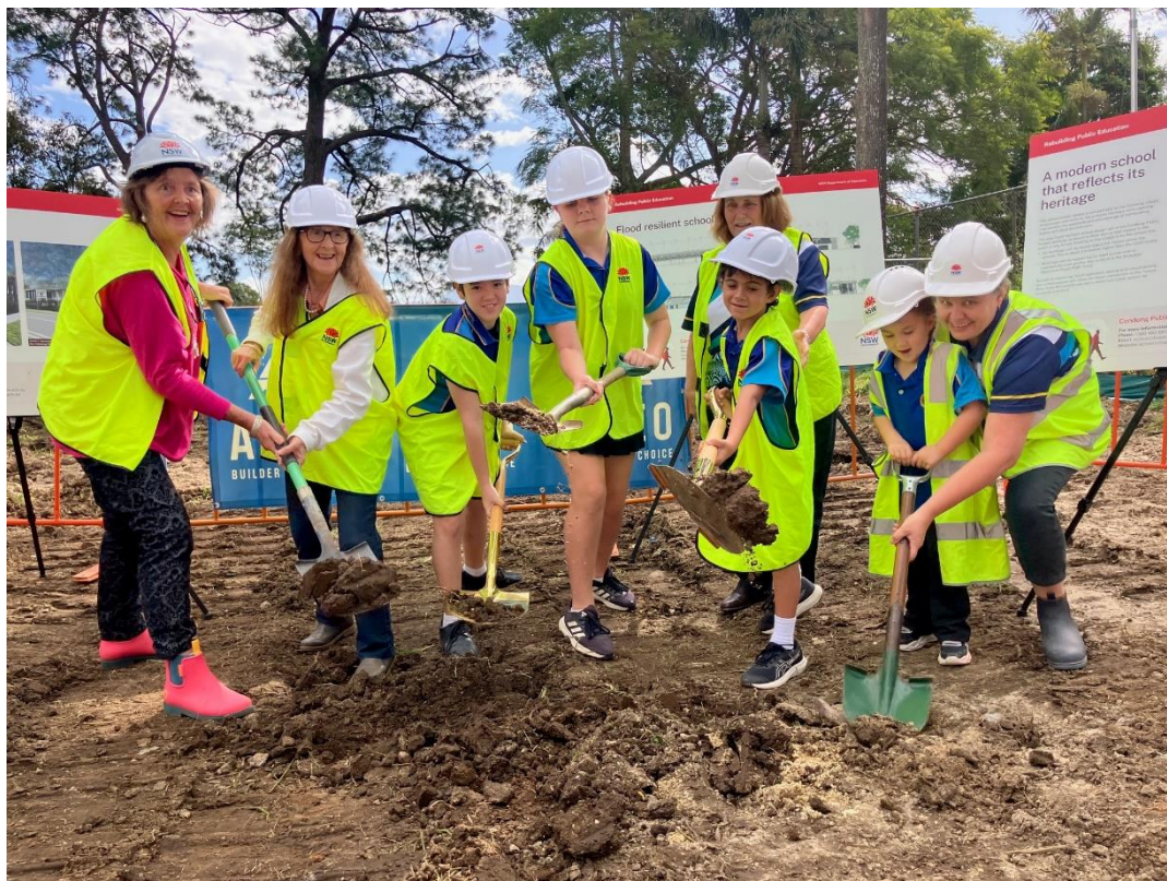
Turning the first sod to mark the start of construction at Condong Public School