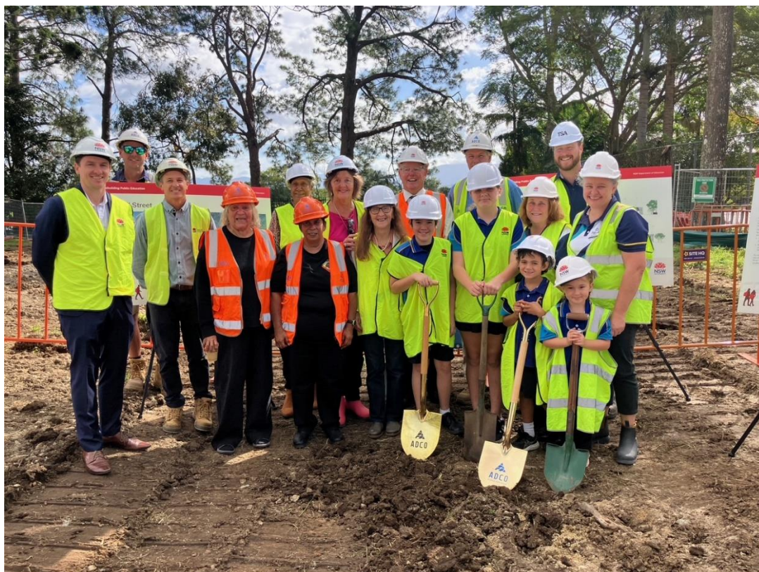
Celebrating the start of construction on the Condong Public School site