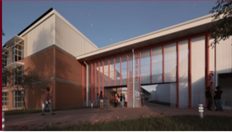
Image caption: Artist impression of the new school entrance on Third Avenue. Subject to change.