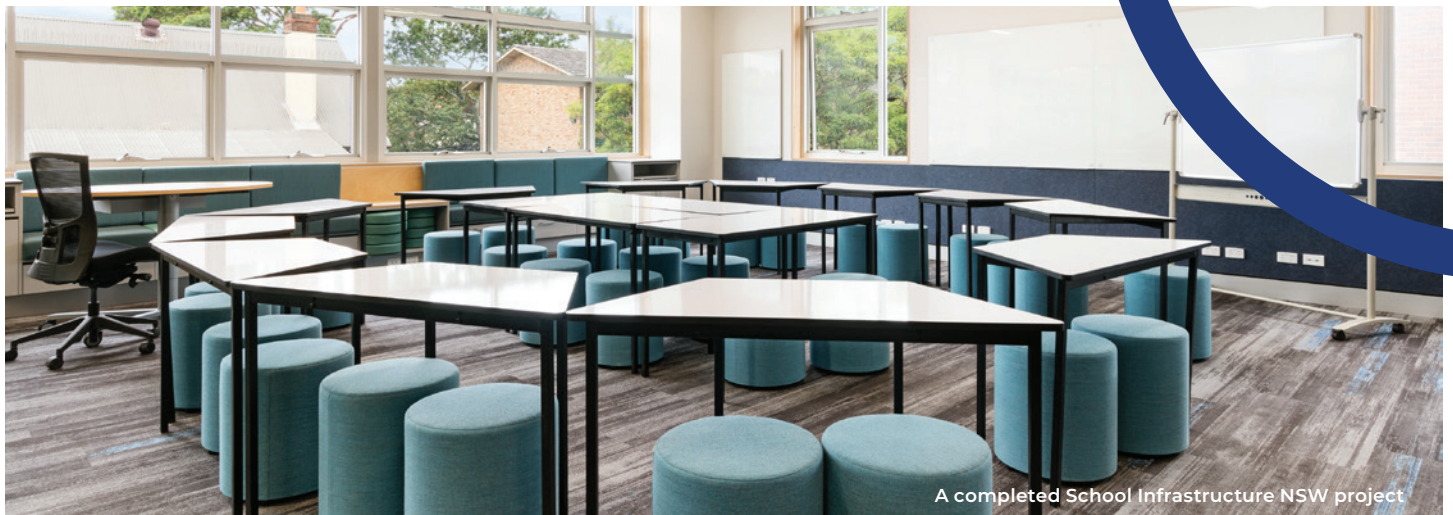
A completed School Infrastructure NSW project