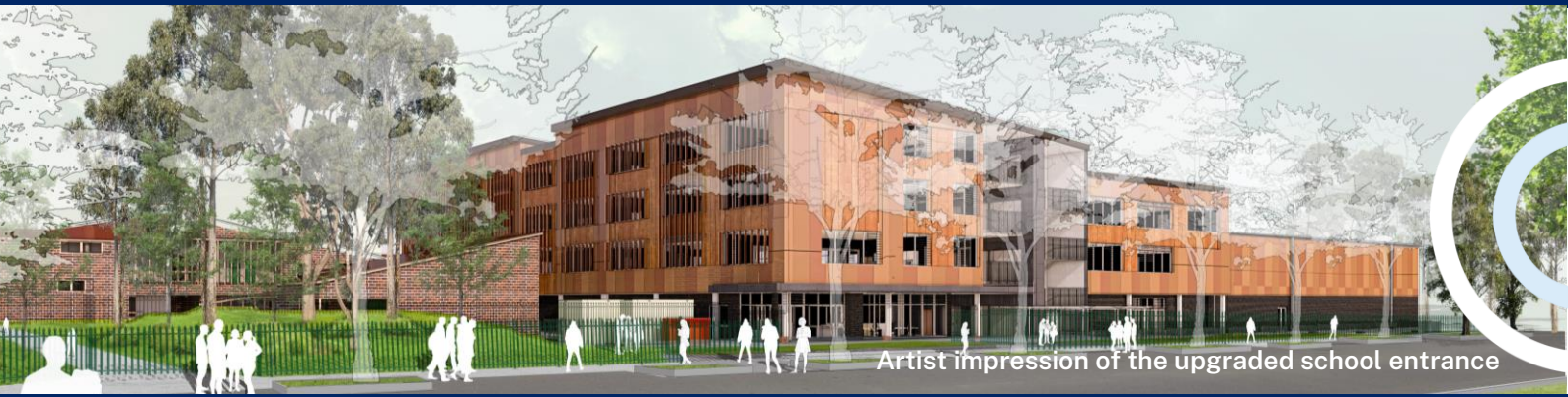
Artist impression of the upgraded school entrance