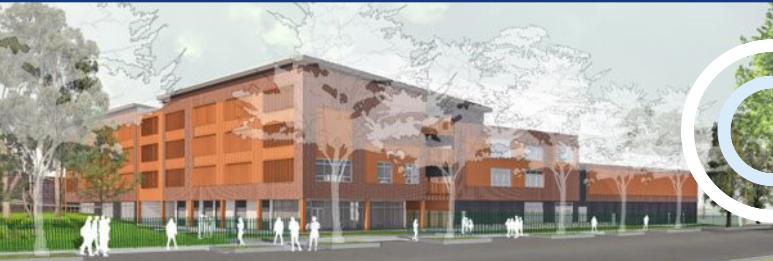
Artist impression of the upgraded school entrance (subject to change)