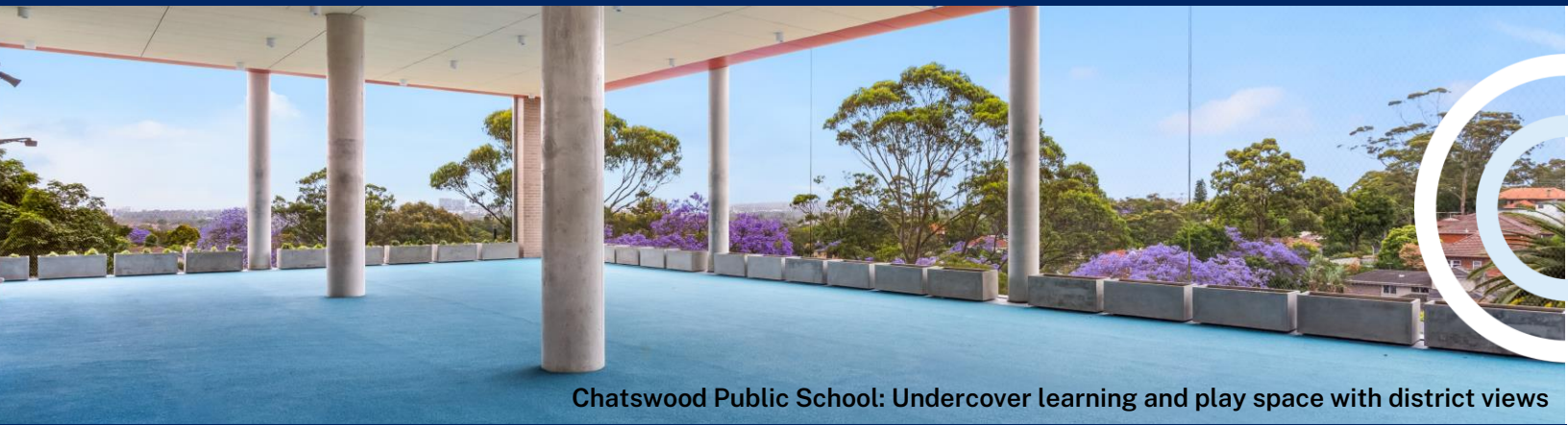
Chatswood Public School: Undercover learning and play space with district views