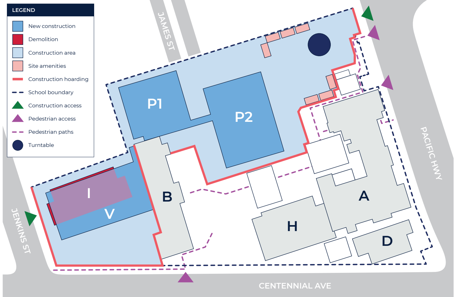
Indicative map of Chatswood Public School's current work zone