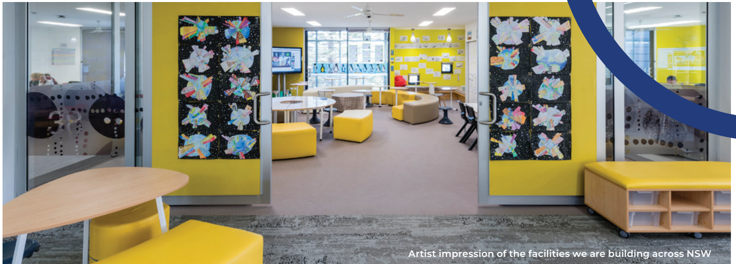
Artist impression of the facilities we are building across NSW