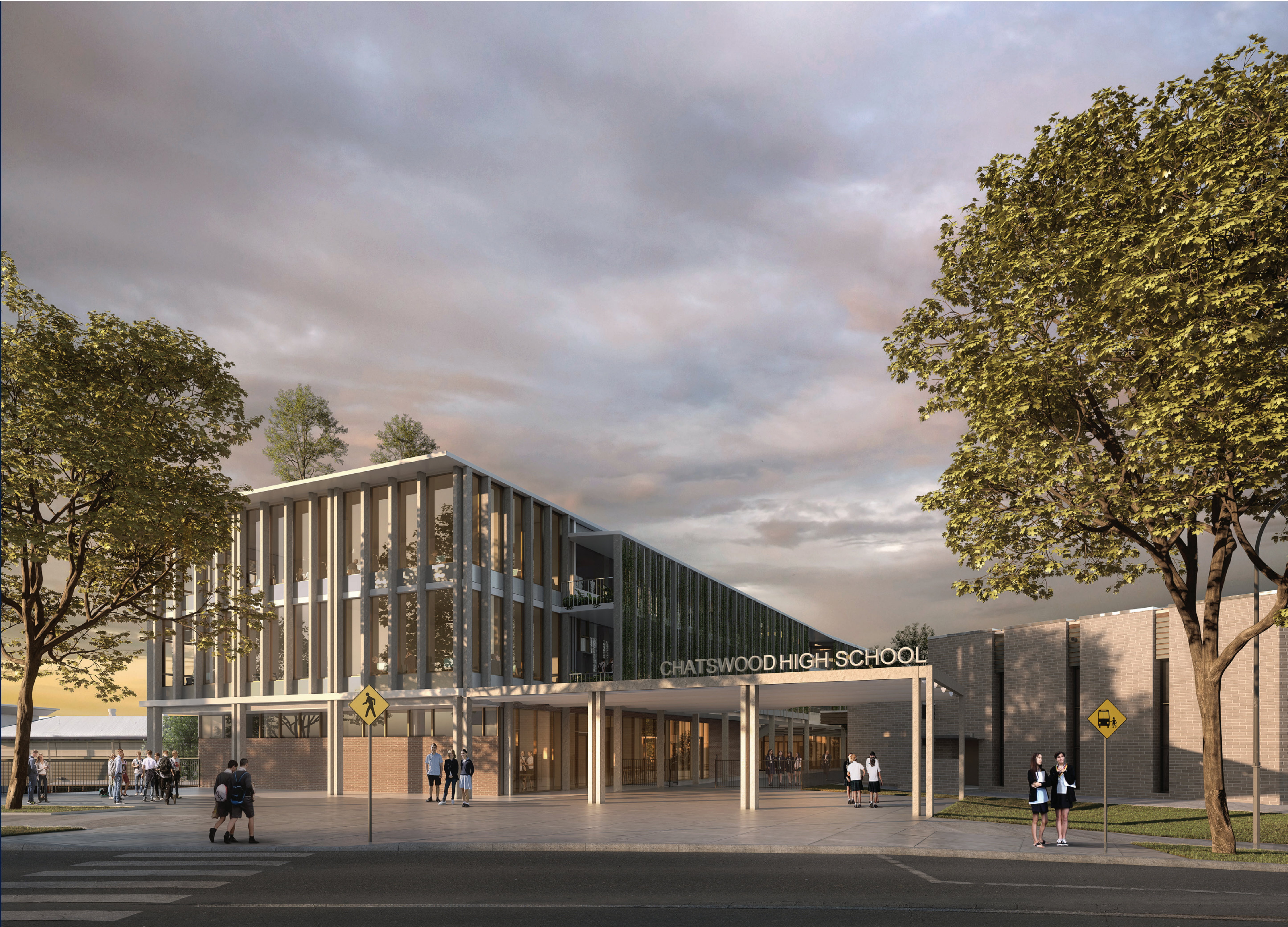
Artist impression of the proposed Chatswood High School entrance from Centennial Avenue