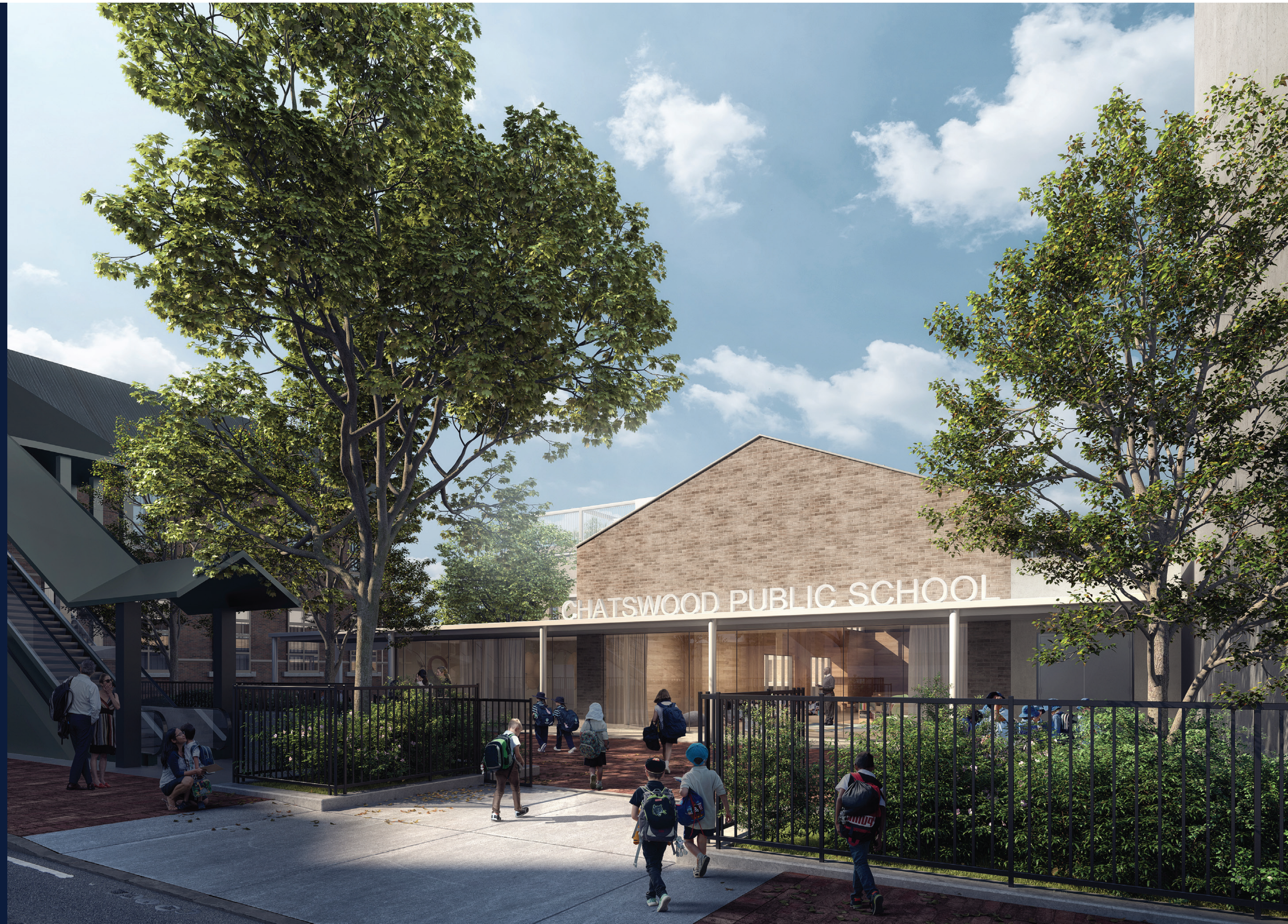
Artist impression of the proposed Chatswood Public School entrance from the Pacific Highway

Building R is progressing well and is anticipated for completion in early 2022.