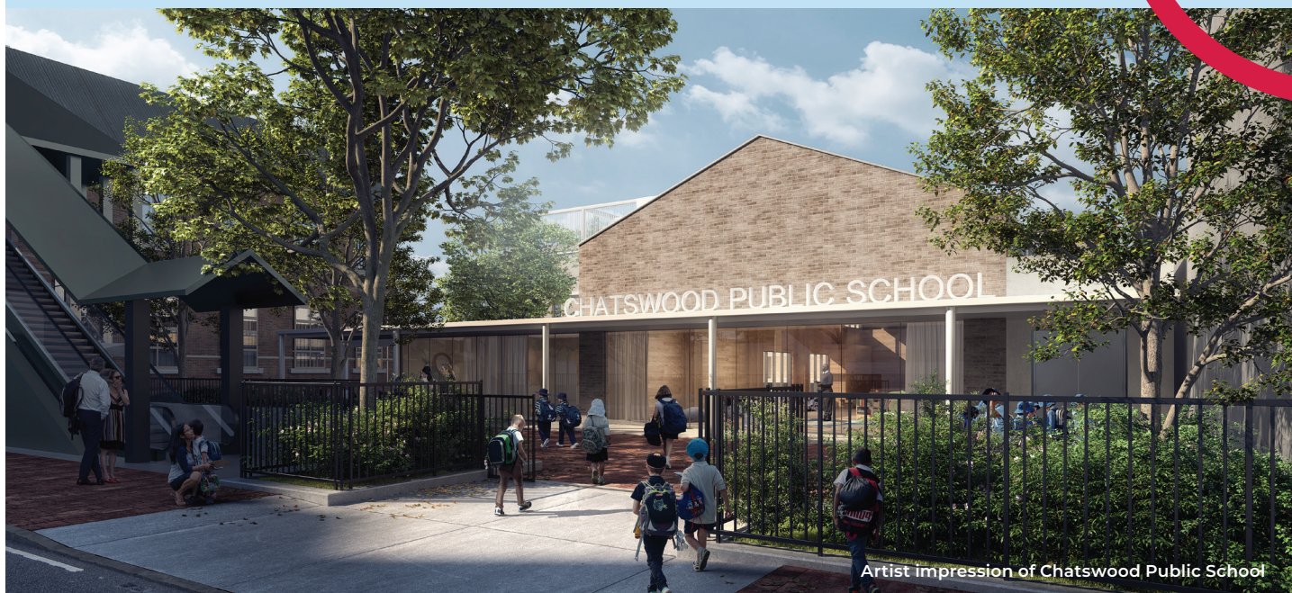
Artist impression of Chatswood Public School

The NSW Government is investing $7 billion over the next four years, continuing its program to deliver more than 200 new and upgraded schools to support communities across NSW. This is the largest investment in public education infrastructure in the history of NSW.