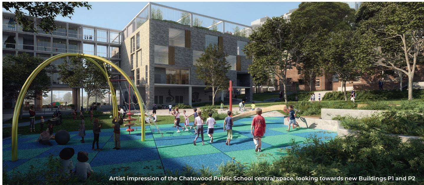
Artist impression of the Chatswood Public School central space, looking towards new Buildings P1 and P2