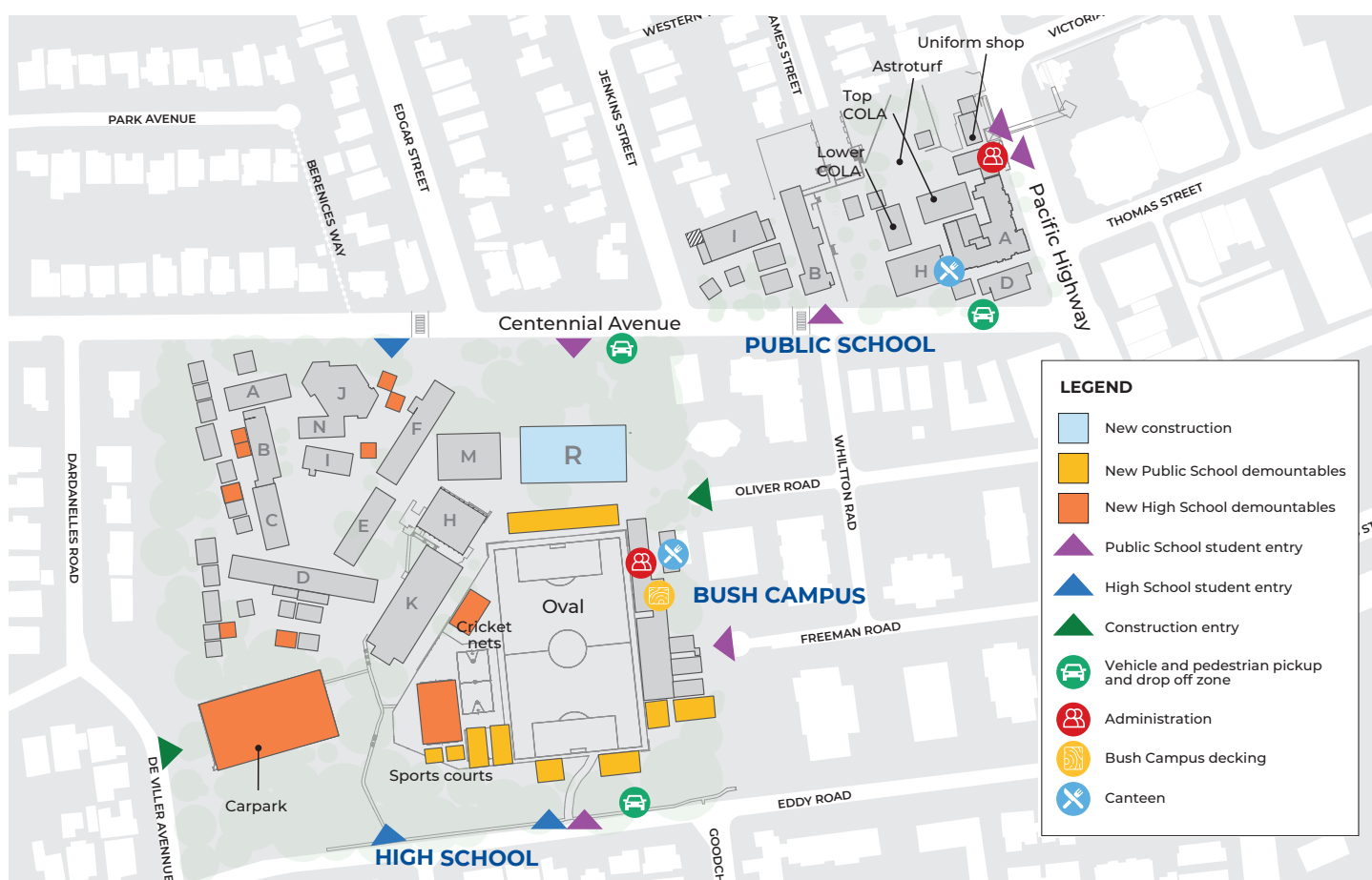
Chatswood Public School Main Campus and Bush Campus map

The Multi-Categorical Support Class will enter via the Eddy Road entrance and meet on the oval at 8:55am on Friday 29 January 2021.