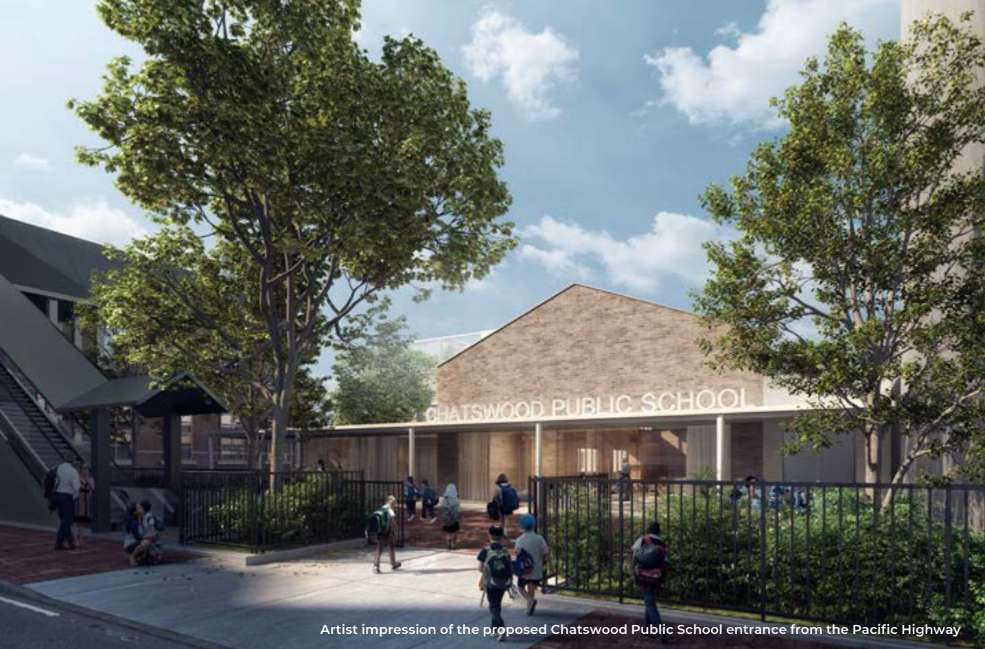
Artist impression of the proposed Chatswood Public School entrance from the Pacific Highway