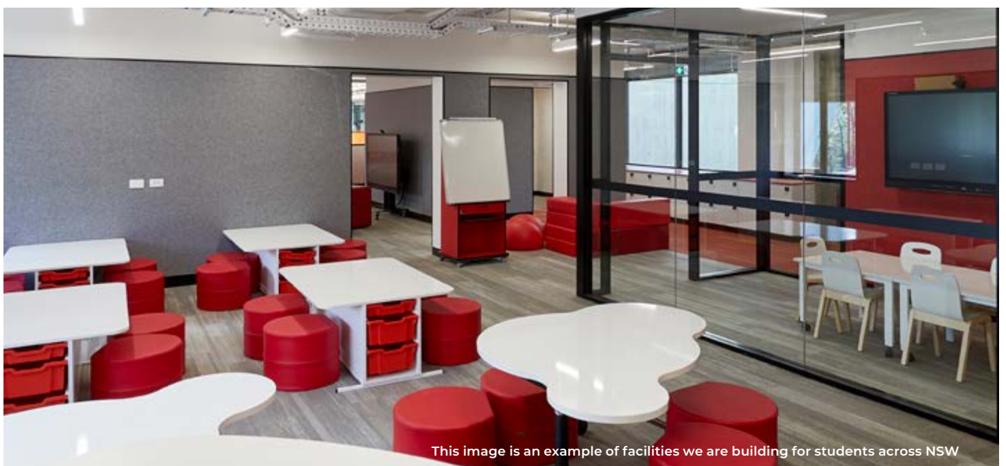
This image is an example of facilities we are building for students across NSW

The Department is pleased to confirm that separate to this development application, planning is underway for a new primary school in the Chatswood area.