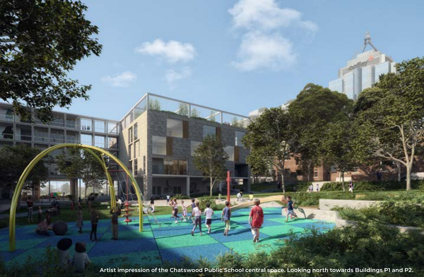
Artist impression of the Chatswood Public School central space. Looking north towards Buildings P1 and P2.