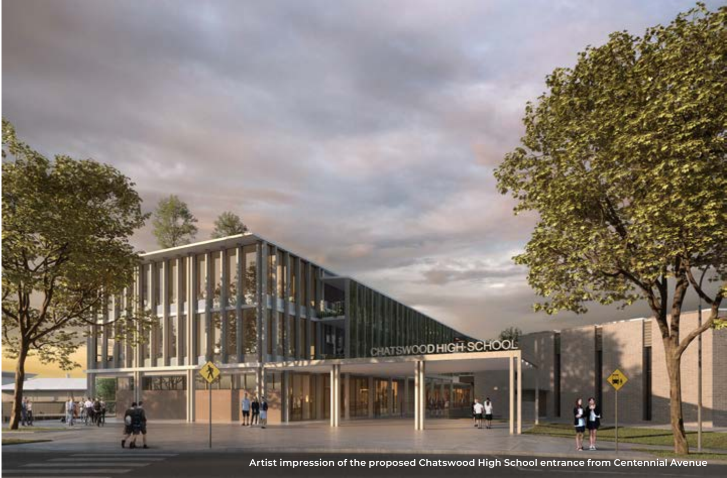
Artist impression of the proposed Chatswood High School entrance from Centennial Avenue