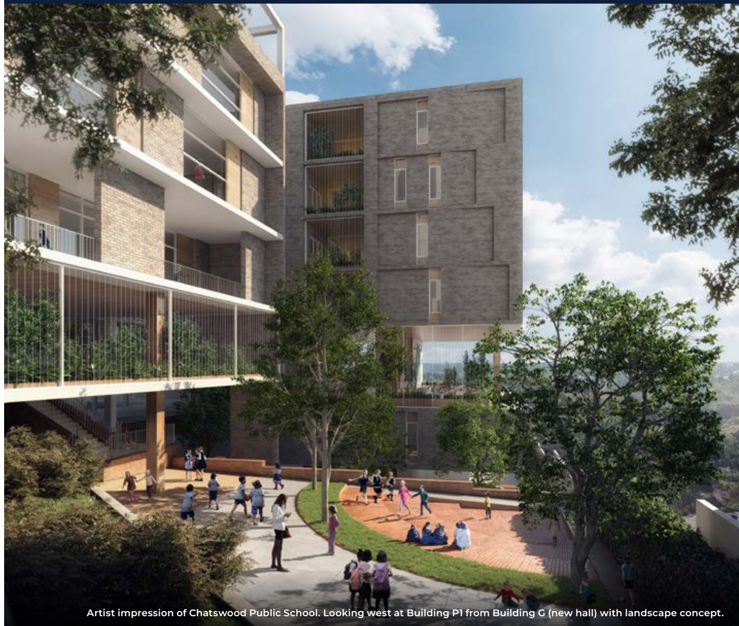
Artist impression of Chatswood Public School. Looking west at Building P1 from Building G (new hall) with landscape concept.

The NSW Government is investing $6.7 billion over four years to deliver more than 190 new and upgraded schools to support communities across NSW. In addition, a record $1.3 billion is being spent on school maintenance over five years. This is the largest investment in public education infrastructure in the history of NSW.