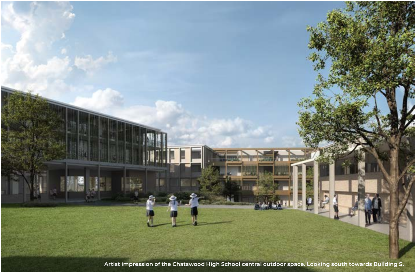
Artist impression of the Chatswood High School central outdoor space. Looking south towards Building S.