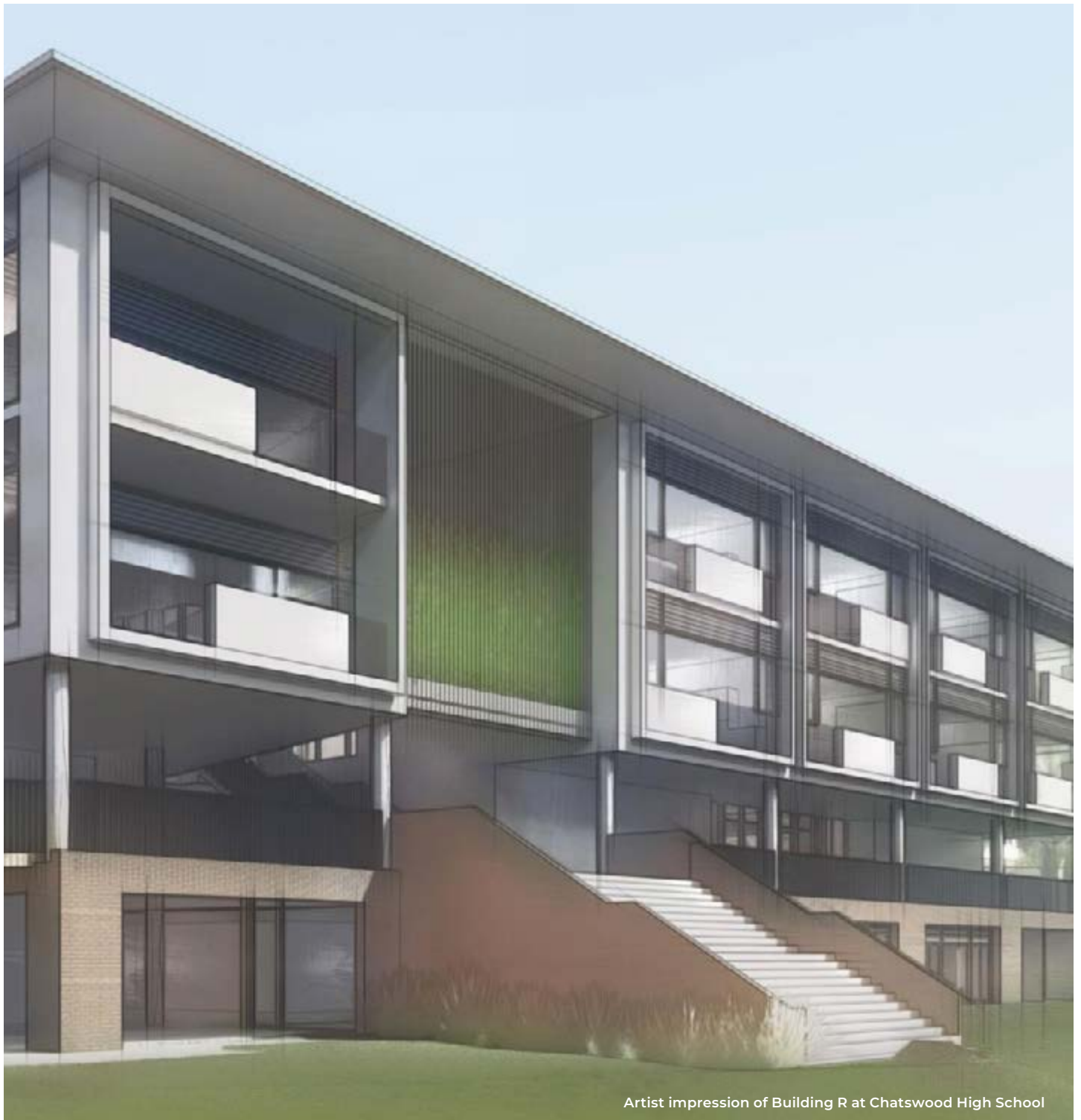
Artist impression of Building R at Chatswood High School

An accredited certifier will review the plans for the building and the construction process. A Complying Development Certificate is issued subject to conditions of approval and prior to construction works commencing.