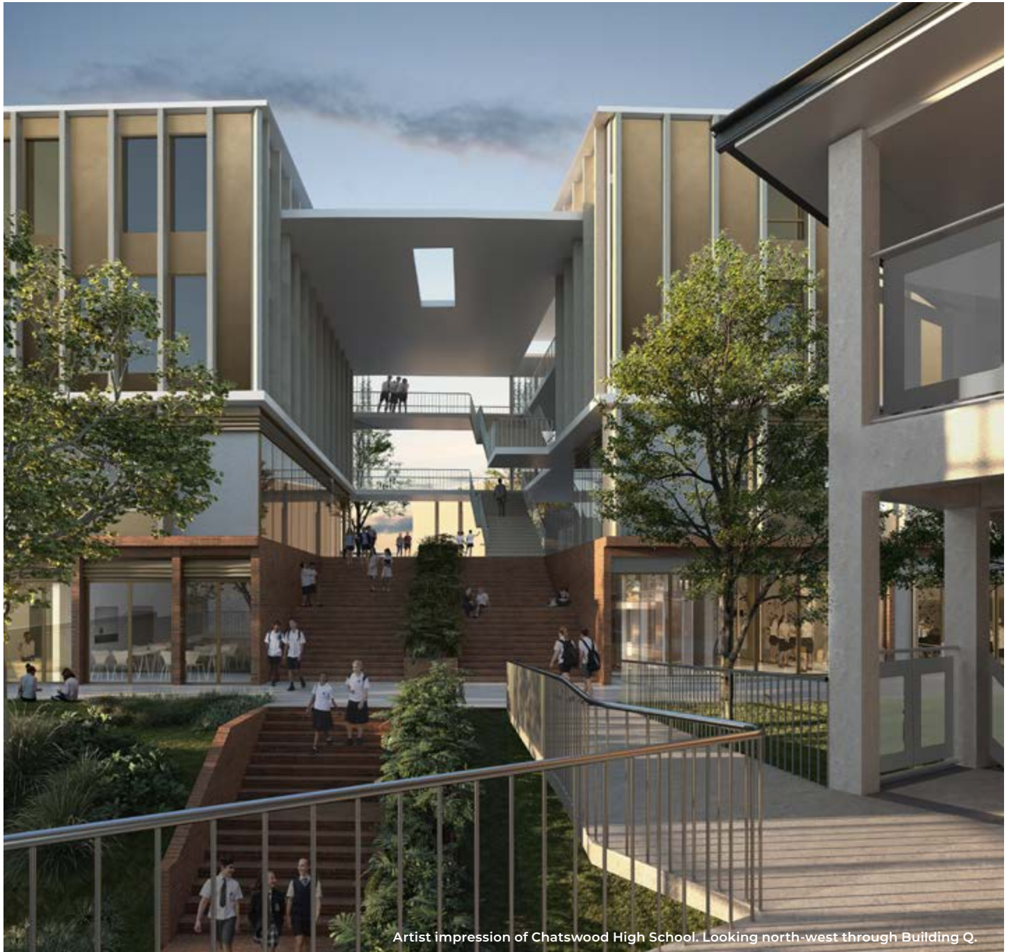
Artist impression of Chatswood High School. Looking north-west through Building Q.

Construction of Building R under complying development is anticipated to start in 2020 with remaining SSD works commencing in 2021, should consent be granted. The expected completion date is late 2023.