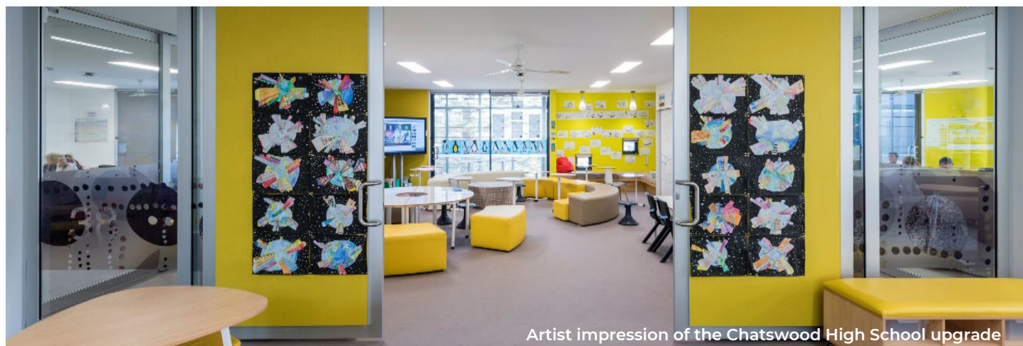
Artist impression of the Chatswood High School upgrade