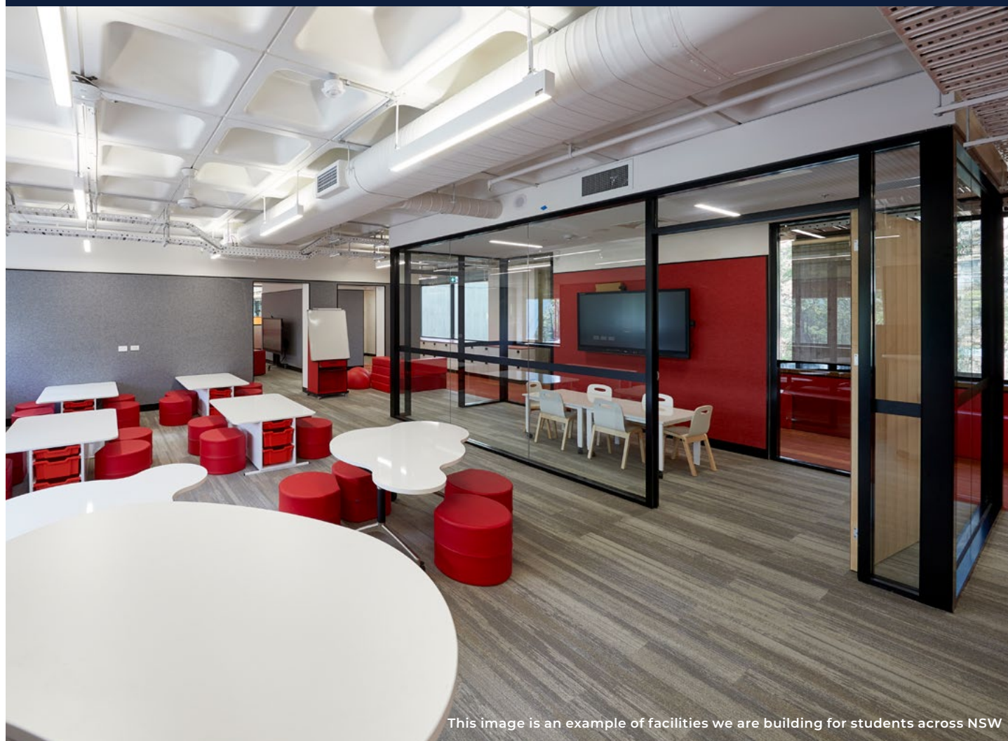
This image is an example of facilities we are building for students across NSW

The Chatswood Education Precinct will include the redevelopment, relocation and expansion of Chatswood Public School, Chatswood High School and Chatswood Intensive English Centre (IEC).