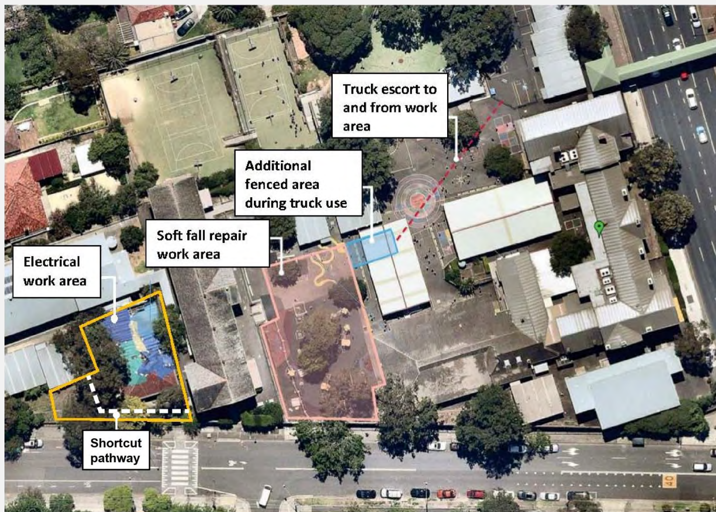
Chatswood Public School soft fall work area and Block C work area

We are here to make sure that work is completed safely and efficiently, while also minimising impacts on the school and community at every opportunity.