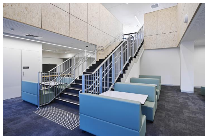
Figure 3: Building Q new library