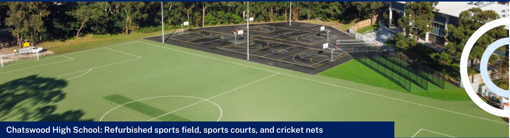
Chatswood High School: Refurbished sports field, sports courts, and cricket nets