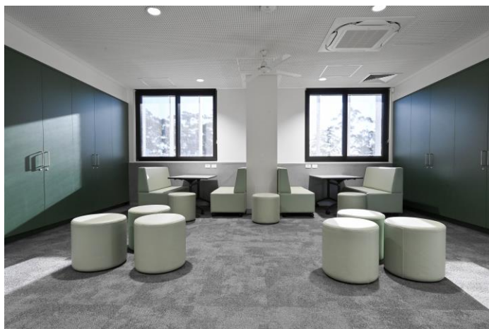
Figure 2: Building Q was handed over in June 2023 and is home to a number of flexible breakout areas as shown above