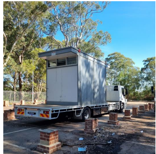
Figure 1: Final temporary demountable classroom leaving Chatswood High School

Standard construction hours for this project are 7 am to 6 pm Monday to Friday, and 8 am to 4 pm, Saturdays. No works will take place on Sundays or public holidays, unless otherwise notified.