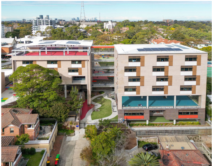
Northern facade of Buildings P1 and P2 (includes view of inclusive learning sensory garden and ground floor COLA)