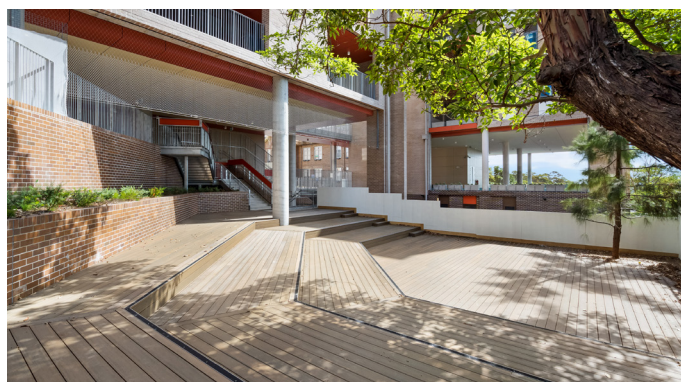
Amphitheatre for outdoor learning and play space