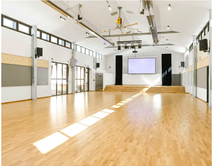
School hall with stage, audio visual equipment, kitchenette and storage