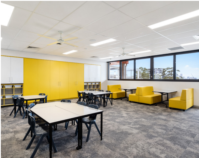
Example of one of many flexible learning classrooms