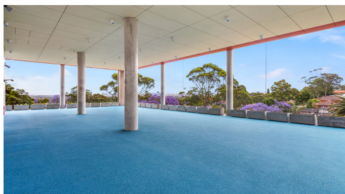
Building P1 ground floor covered outdoor learning area with district views