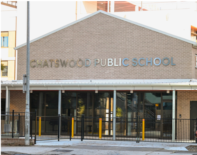
New entrance from Pacific Highway and school hall (Building G)