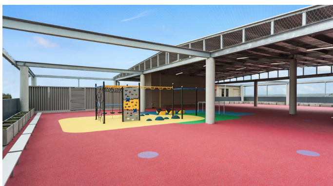
Building P2 rooftop play space with district views