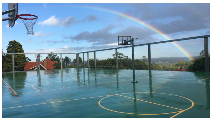
Full size sports court with district views