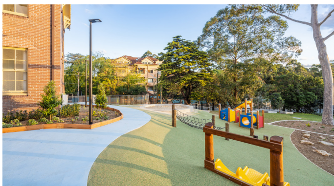
Nature play space