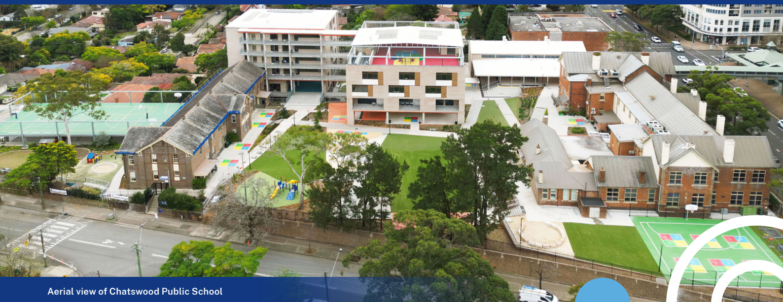
Aerial view of Chatswood Public School