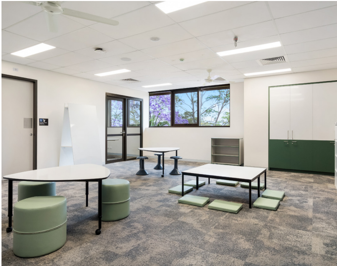
Inclusive learning classroom