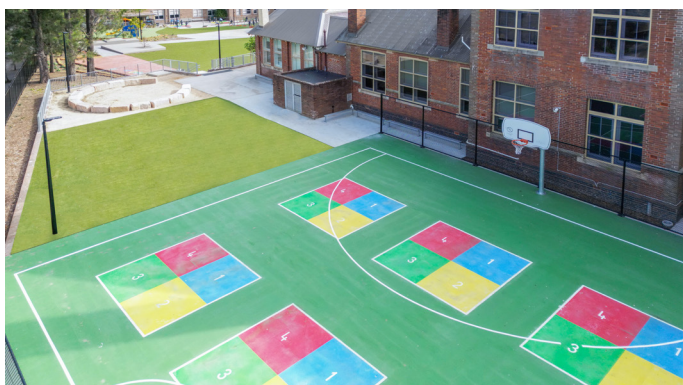
Half court and yarning circle for play and outdoor learning