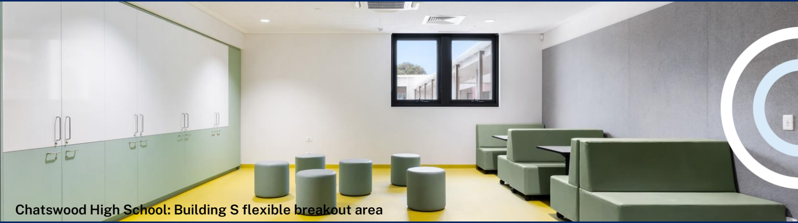
Chatswood High School: Building S flexible breakout area