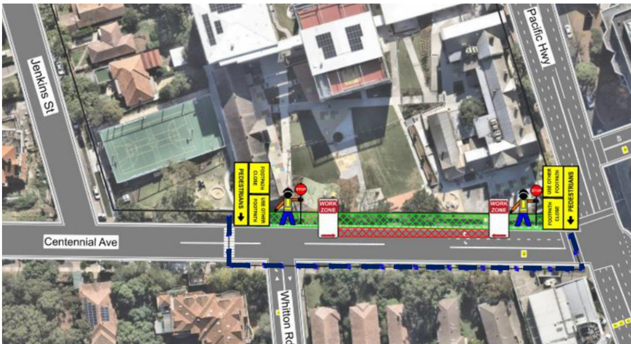
Map showing stage one work zone and pedestrian diversion between Wednesday 14 June and Saturday 17 June