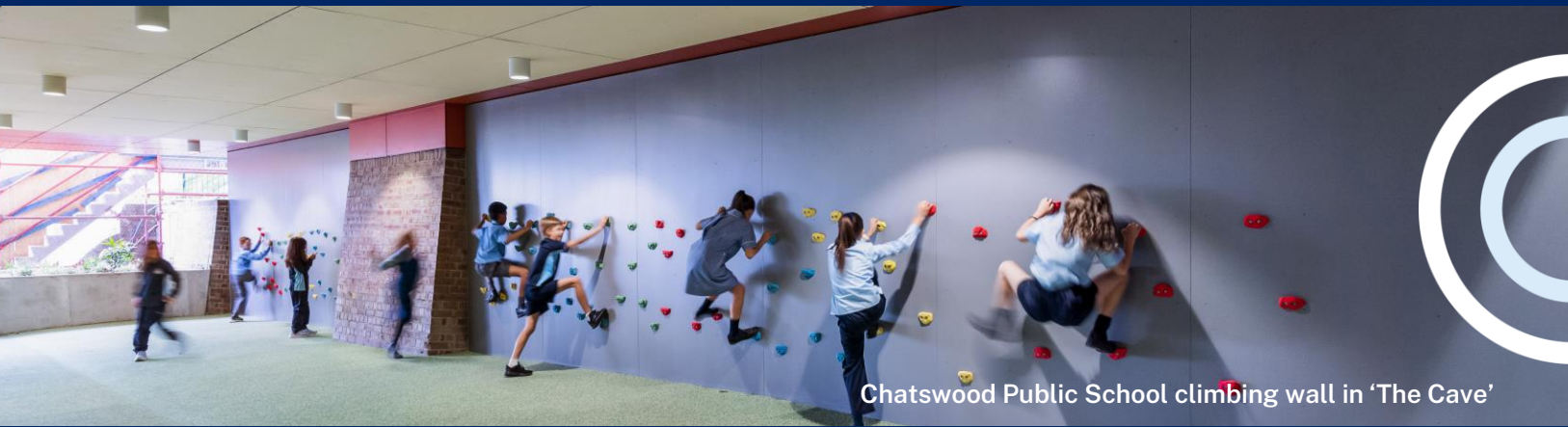
Chatswood Public School climbing wall in 'The Cave'