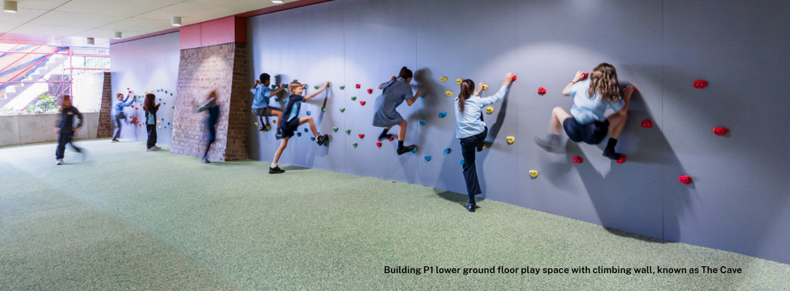
Building P1 lower ground floor play space with climbing wall, known as The Cave