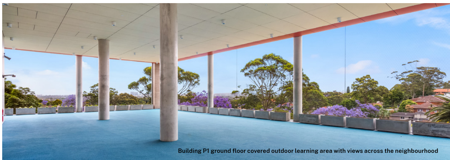
Building P1 ground floor covered outdoor learning area with views across the neighbourhood