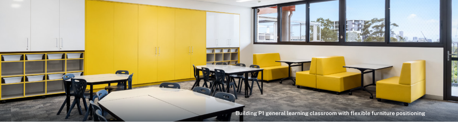
Building P1 general learning classroom with flexible furniture positioning