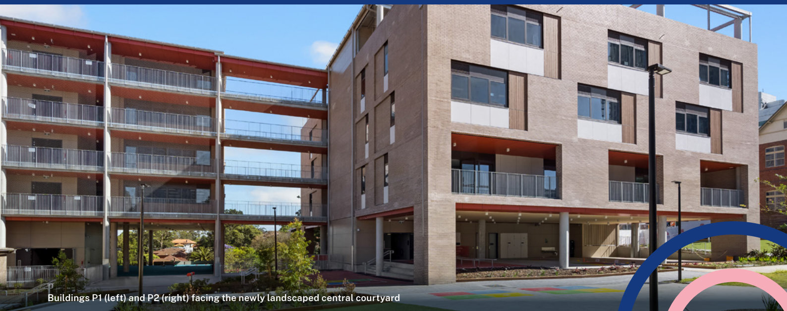
Buildings P1 (left) and P2 (right) facing the newly landscaped central courtyard