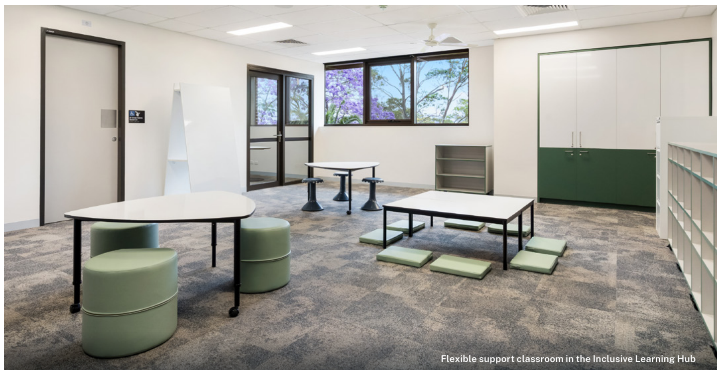
Flexible support classroom in the Inclusive Learning Hub