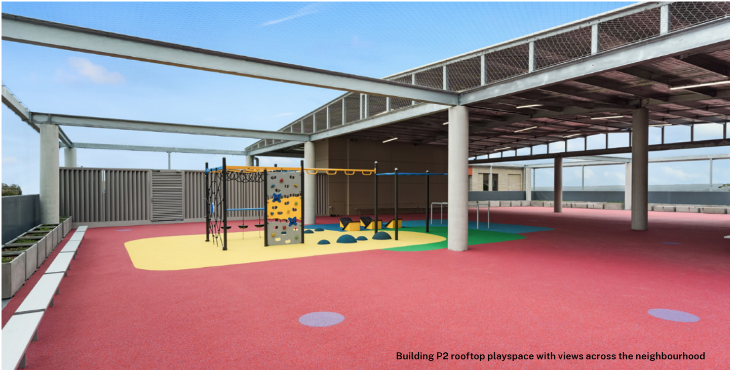
Building P2 rooftop playspace with views across the neighbourhood

Buildings P1 and P2 were designed to maximise the opportunity to integrate play spaces and outdoor learning and to retain the character of the existing school buildings. The buildings have been designed inclusively to allow for ease of movement and access to the different learning spaces, with lifts throughout and a ramp on the ground floor. They are connected to each other on all levels, creating a seamless flow for students and staff. The building itself has several sustainable features, including solar panels, ventilation control measures, and rainwater tanks. Both buildings have significantly increased outdoor areas for learning and play, including the rooftop of Building P2 and the covered areas in P1, which will allow students to enjoy views across the neighbourhood.