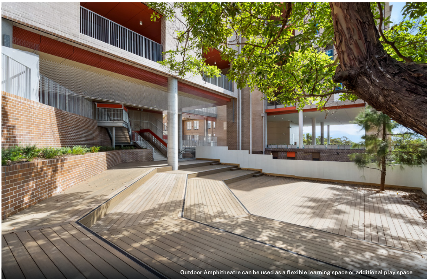
Outdoor Amphitheatre can be used as a flexible learning space or additional play space