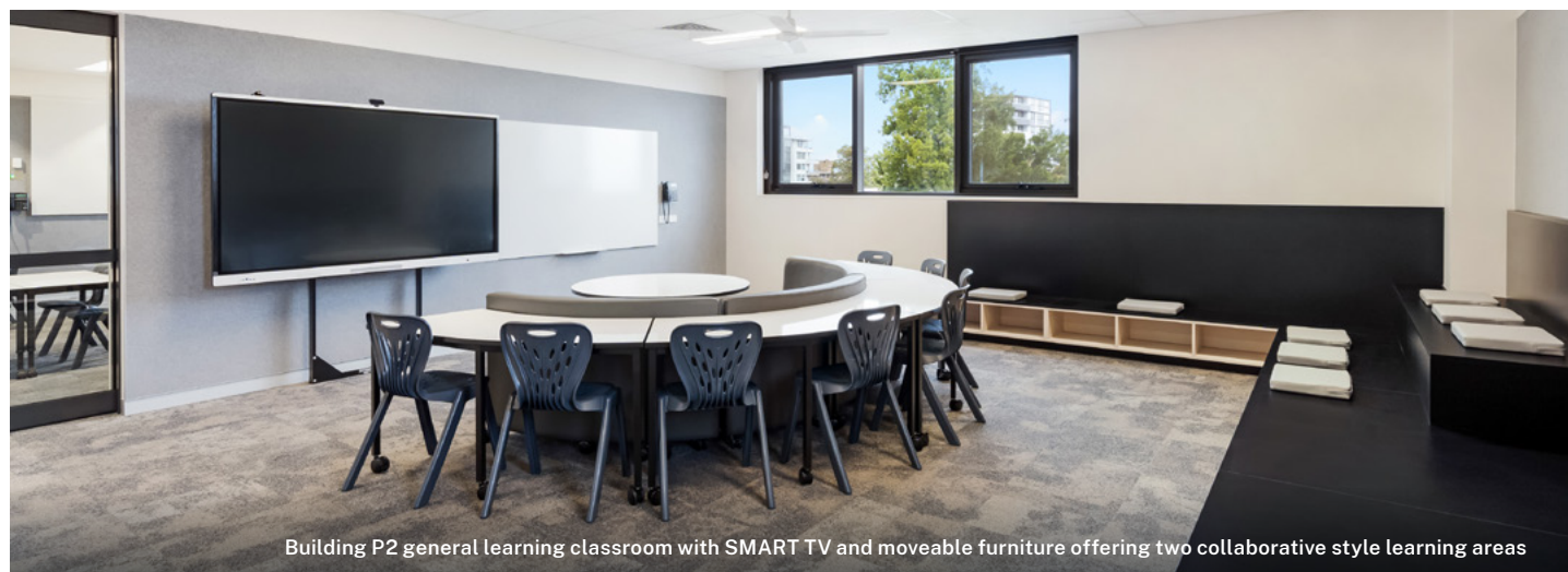
Building P2 general learning classroom with SMART TV and moveable furniture offering two collaborative style learning areas