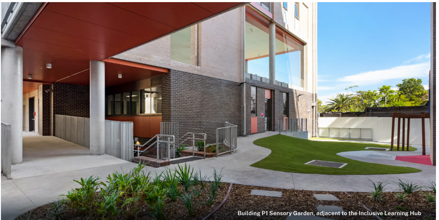
Building P1 Sensory Garden, adjacent to the Inclusive Learning Hub