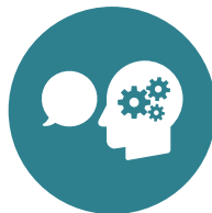
Feedback and reflection