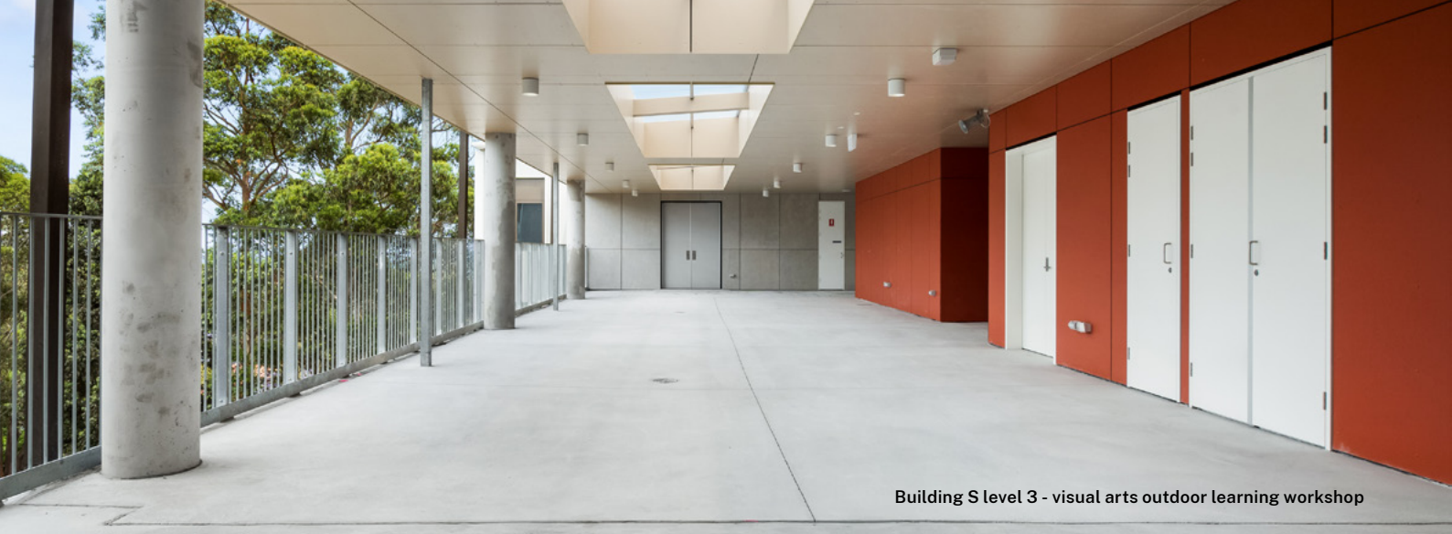
Building S level 3 - visual arts outdoor learning workshop