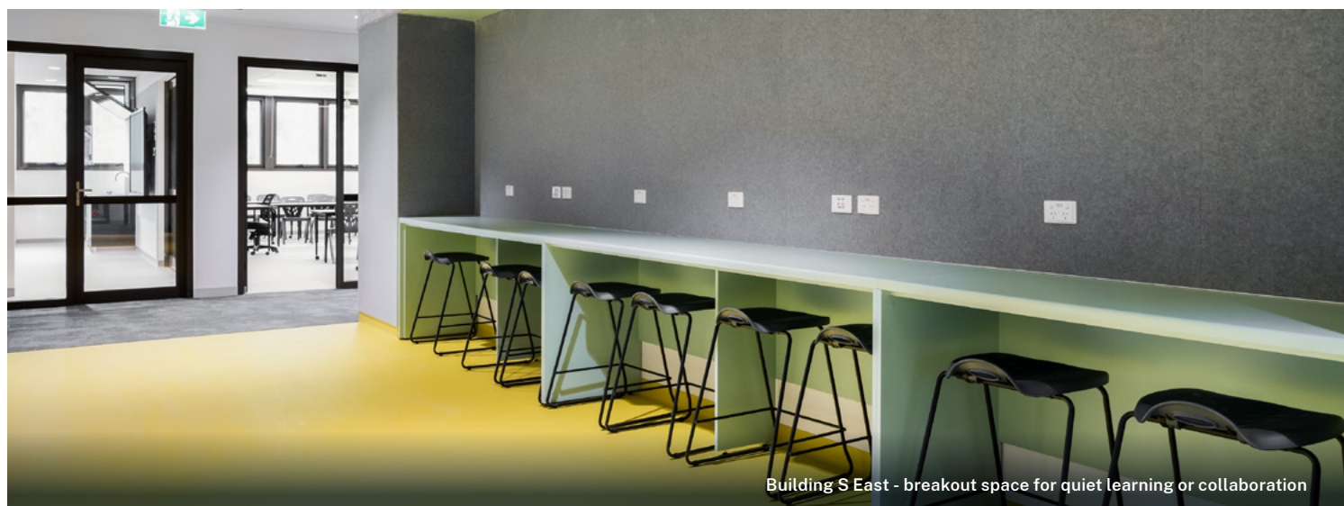
Building S East - breakout space for quiet learning or collaboration