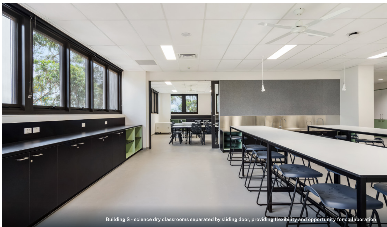
Building S - science dry classrooms separated by sliding door, providing flexibility and opportunity for collaboration