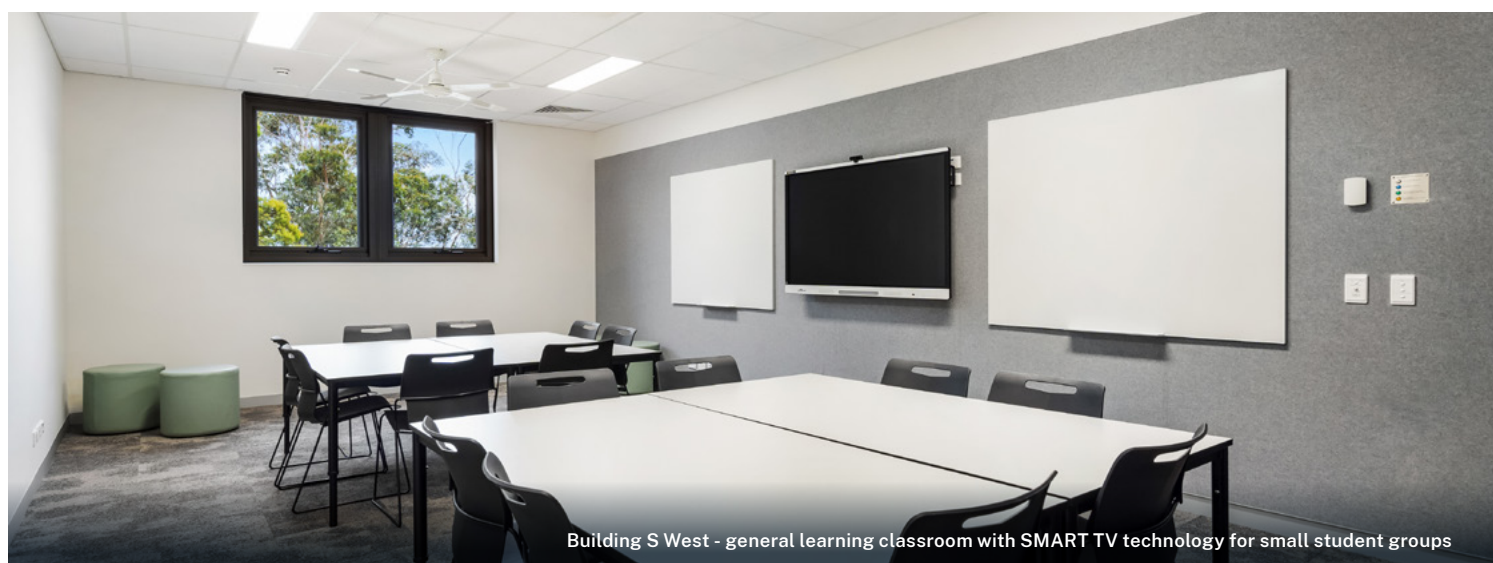
Building S West - general learning classroom with SMART TV technology for small student groups