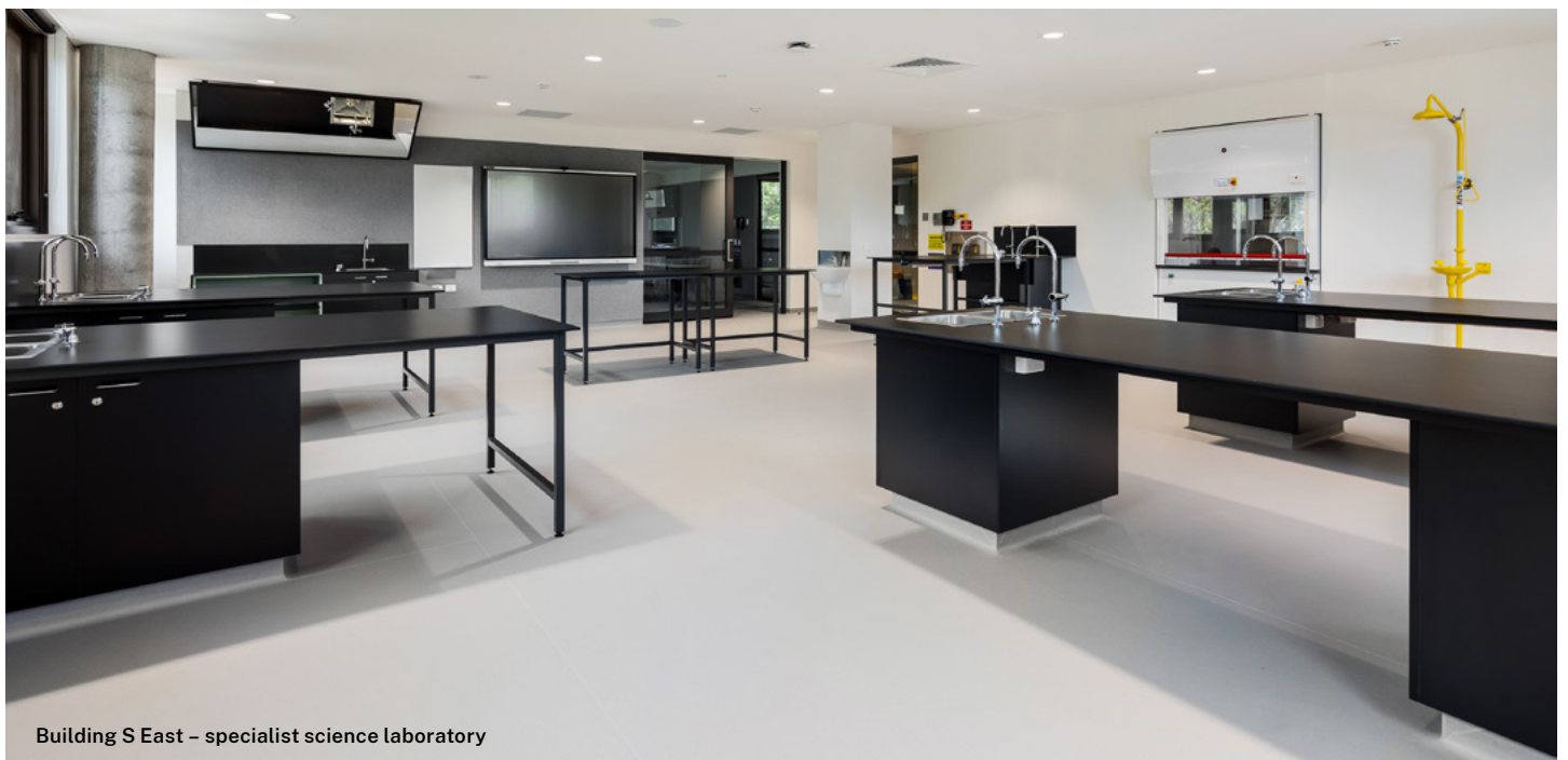
Building S East - specialist science laboratory