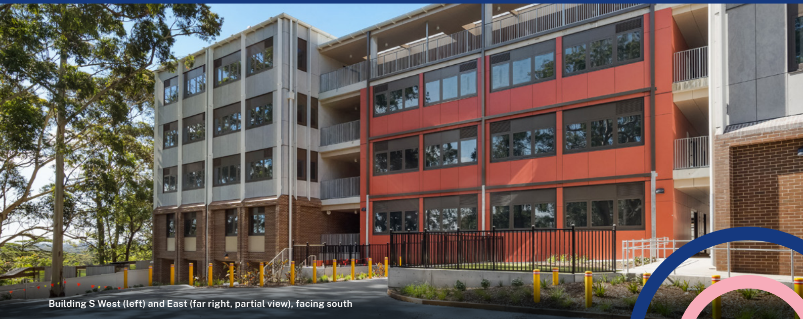
Building S West (left) and East (far right, partial view), facing south