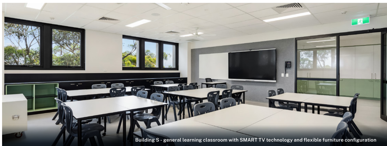
Building S - general learning classroom with SMART TV technology and flexible furniture configuration