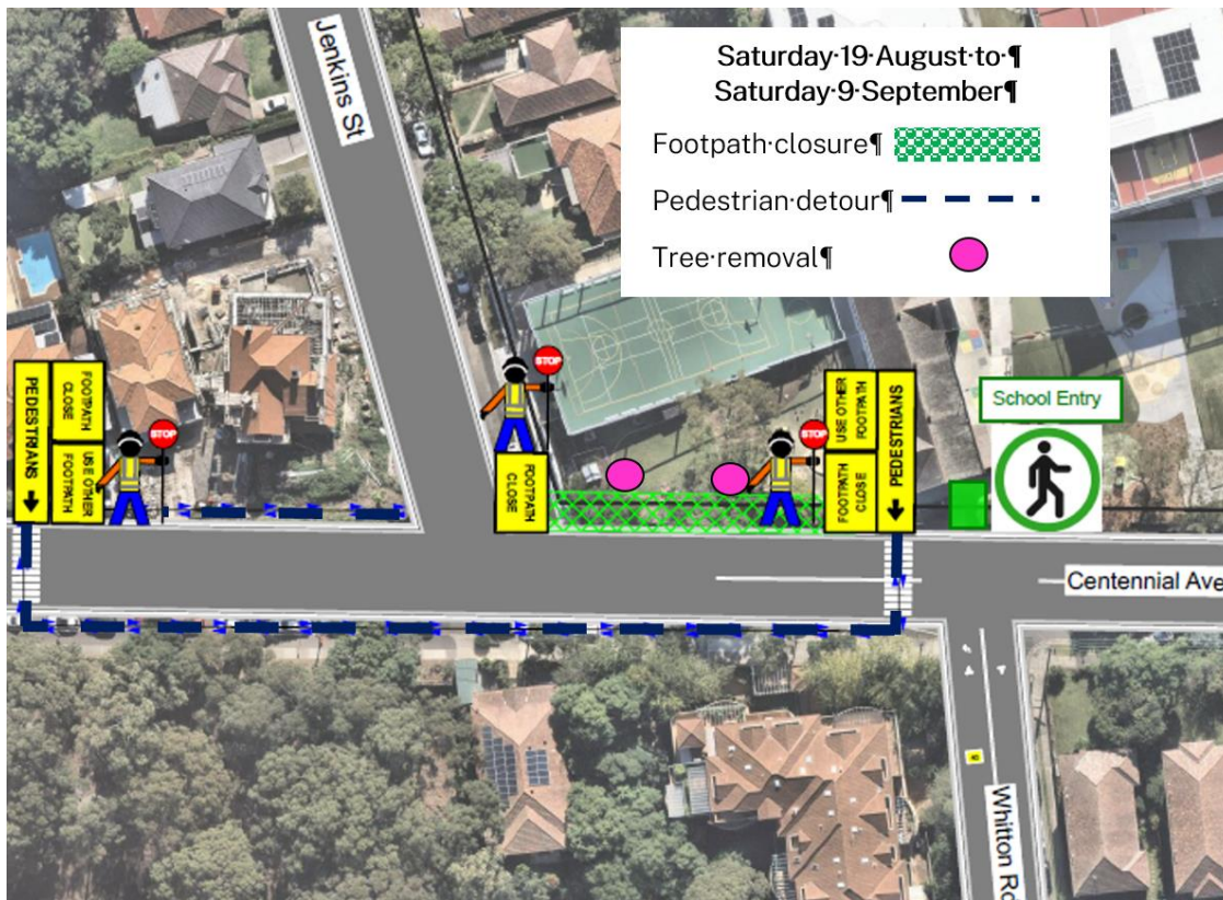
Map of stage two work zone and pedestrian detour