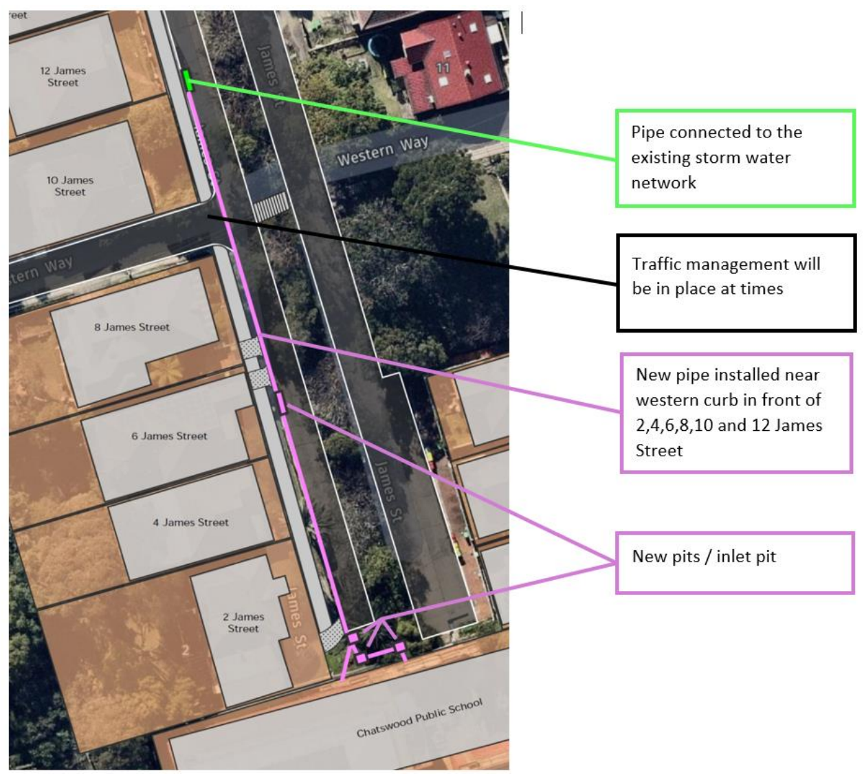
Indicative map of James Street stormwater works

Thank you for your patience while we deliver this important school infrastructure.