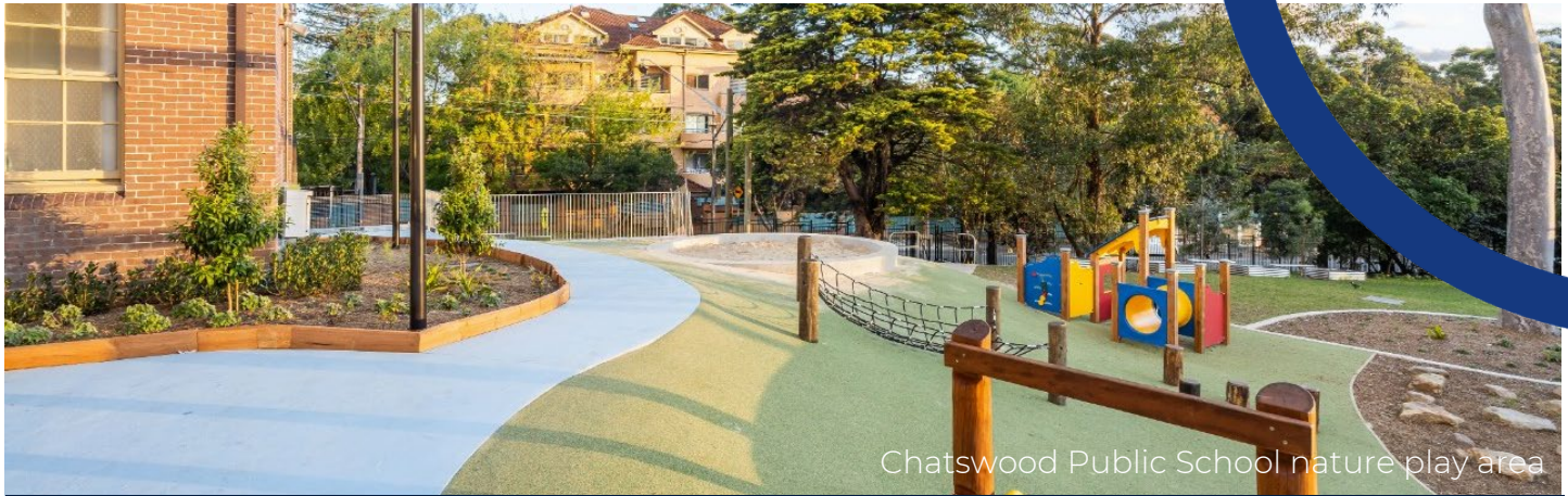
Chatswood Public School nature play area