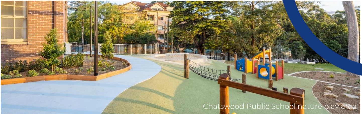
Chatswood Public School nature play area