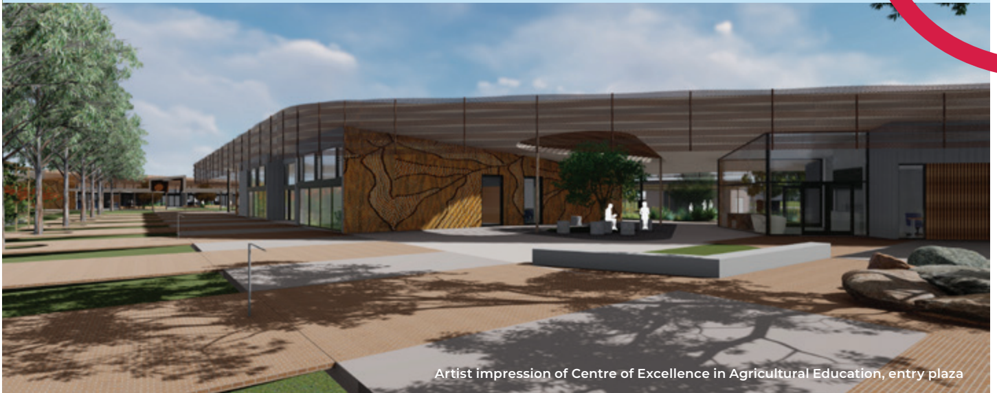
Artist impression of Centre of Excellence in Agricultural Education, entry plaza

The NSW Government is investing $7.9 billion over the next four years to deliver 215 new and upgraded schools to support communities across NSW. This is the largest investment in public education infrastructure in the history of NSW.