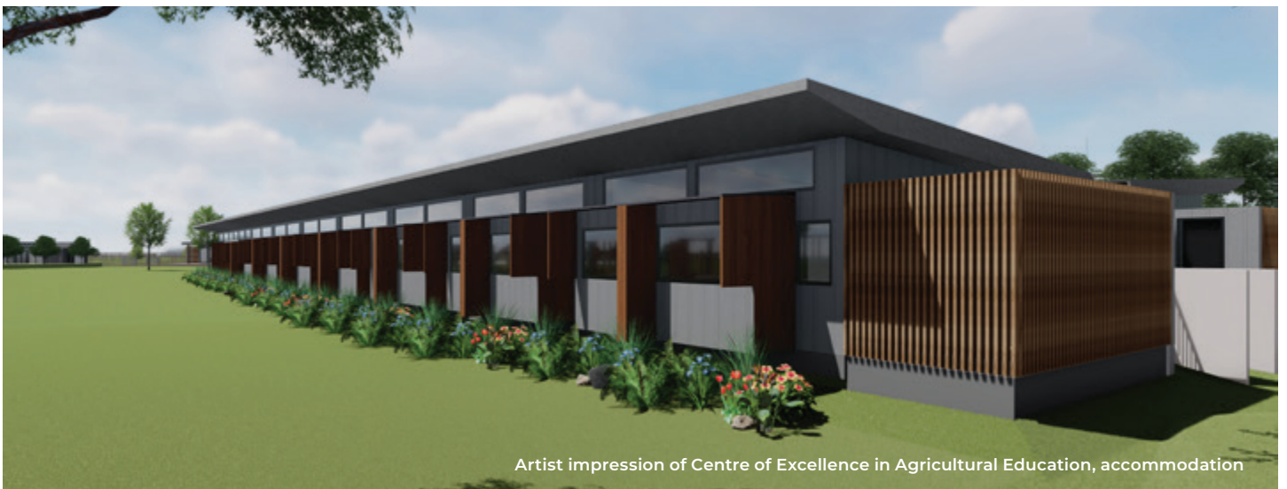
Artist impression of Centre of Excellence in Agricultural Education, accommodation