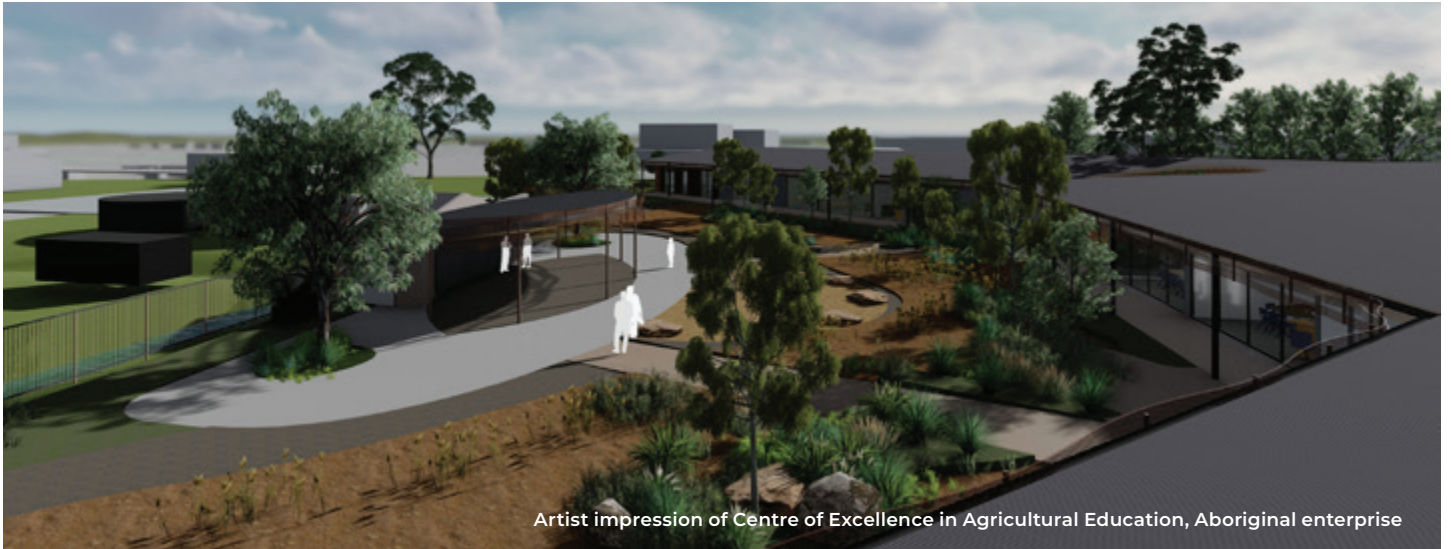
Artist impression of Centre of Excellence in Agricultural Education, Aboriginal enterprise