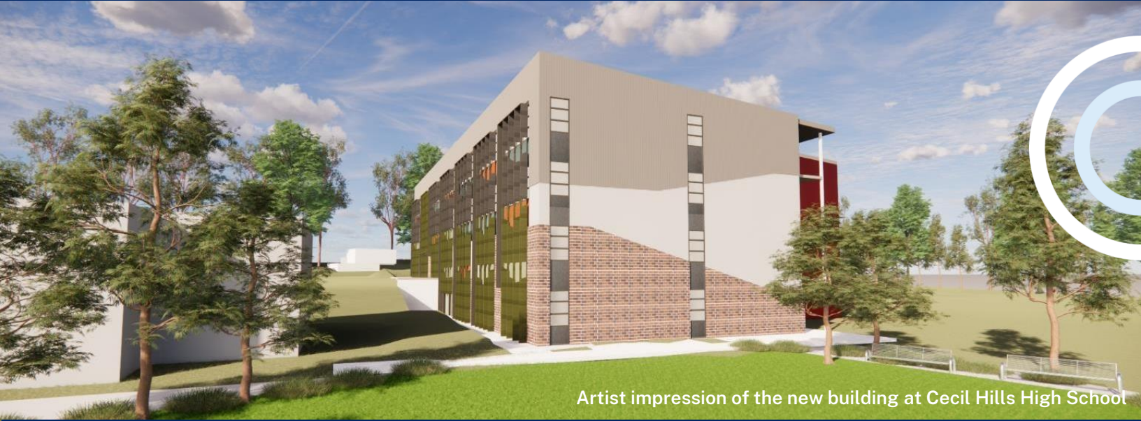
Artist impression of the new building at Cecil Hills High School