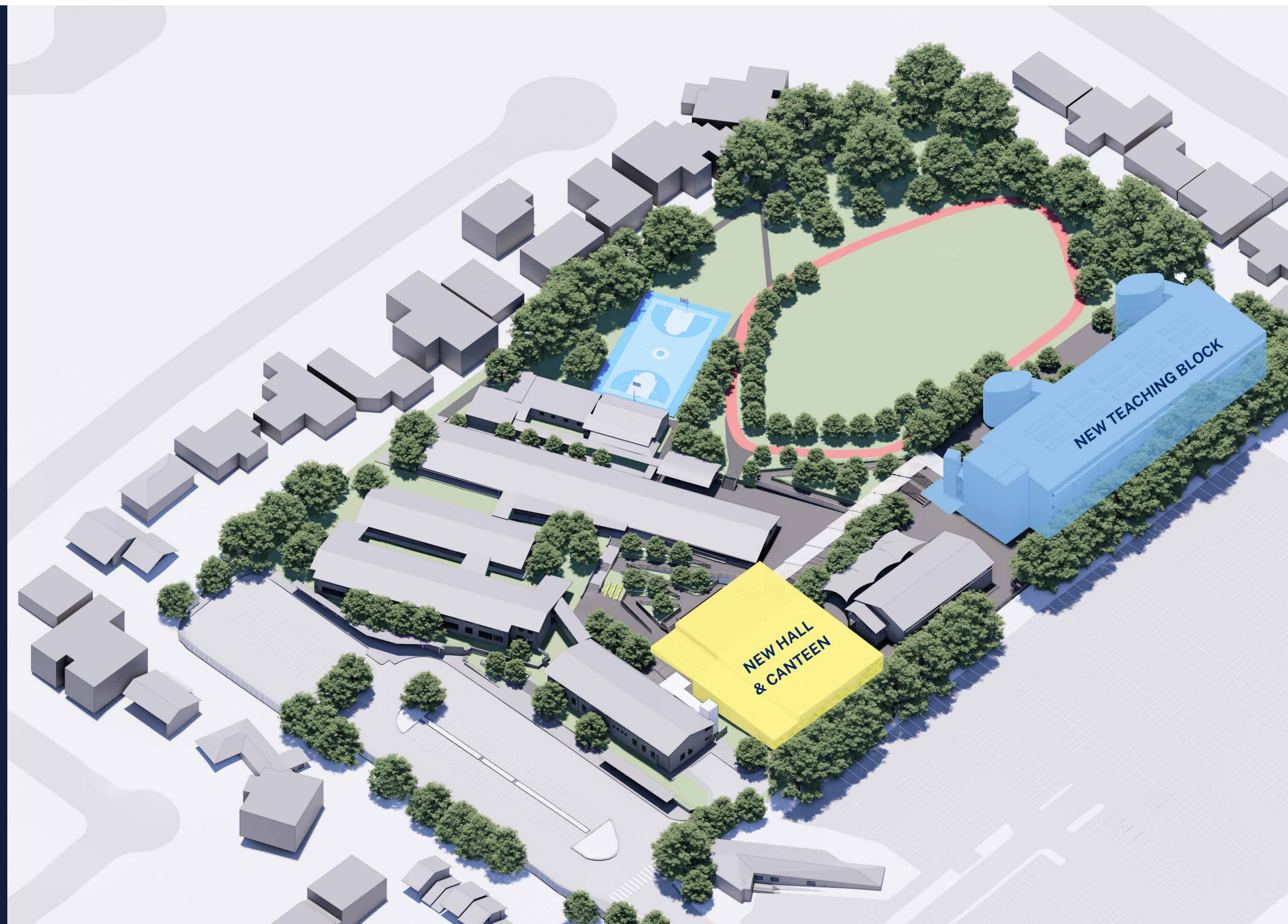
Aerial view. Rendered image, subject to change.

refurbished support learning spaces, administration and staff areas