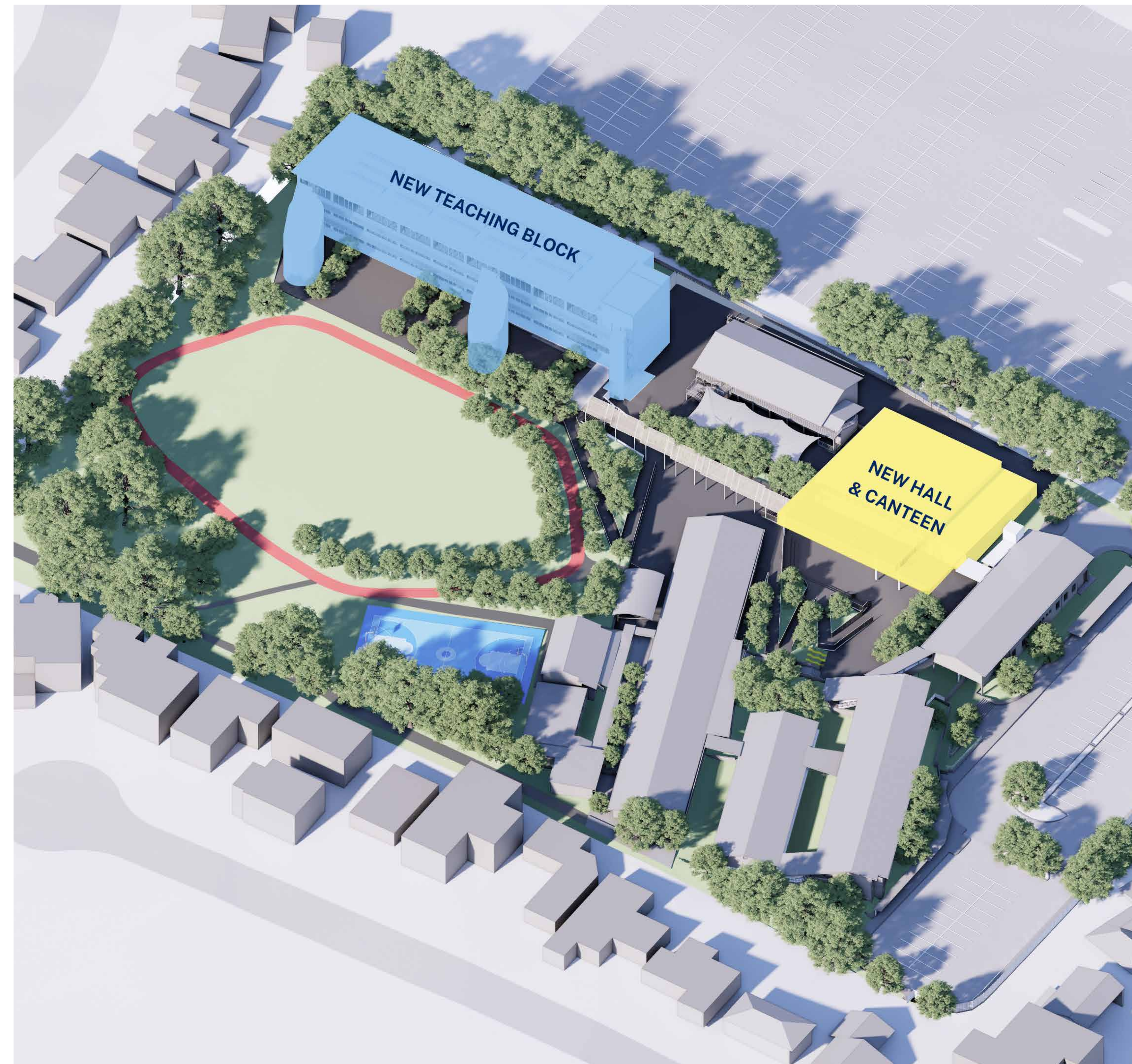
Aerial view. Rendered image, subject to change.

Feedback from school stakeholders will be brought together with input from architects, consultants and the department's technical stakeholder group to ensure the design of the schools reflects best practice and meets Educational Facilities Standards and Guidelines (EFSG).