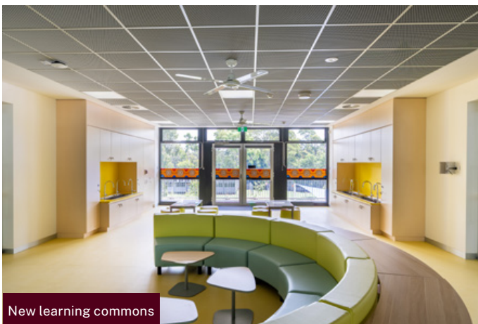
New learning commons