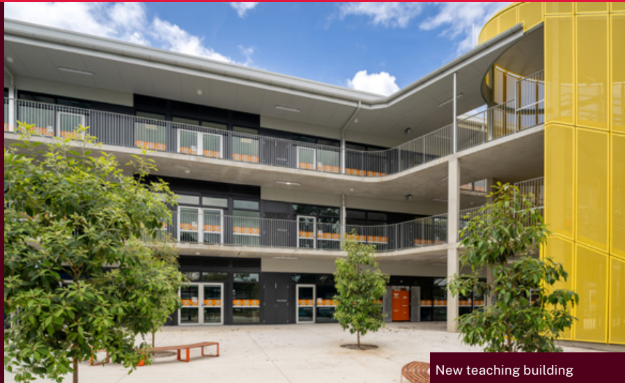
New teaching building