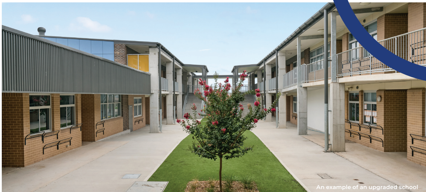
An example of an upgraded school