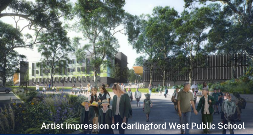
Artist impression of Carlingford West Public School