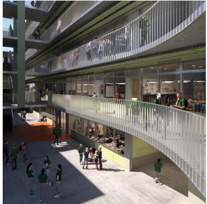
CHS inner walkway