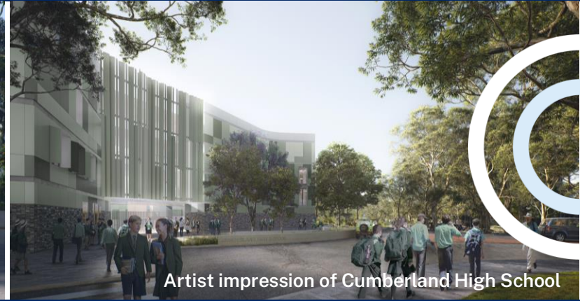
Artist impression of Cumberland High School