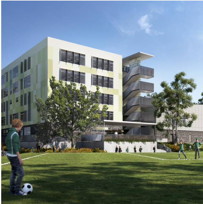
New CHS building looking south from sports field