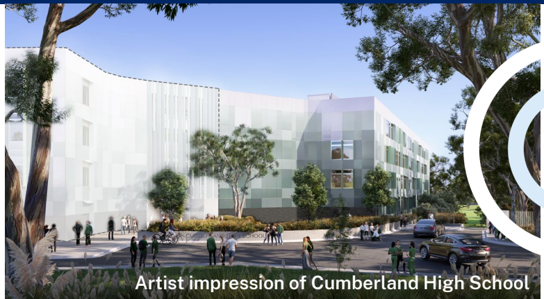
Artist impression of Cumberland High School