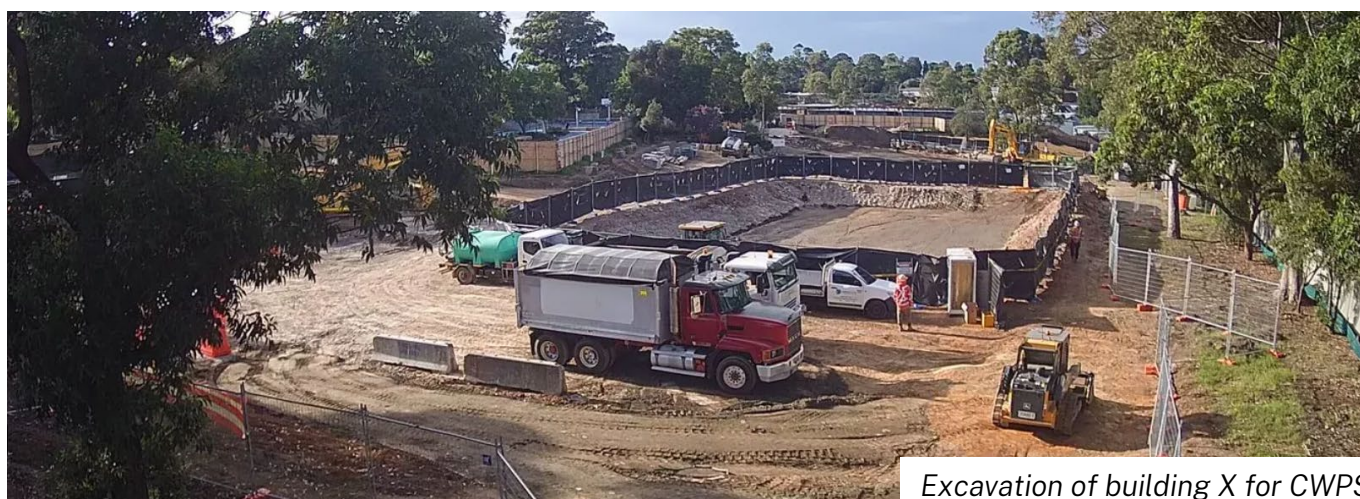
Excavation of building X for CWPS