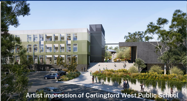
Artist impression of Carlingford West Public School