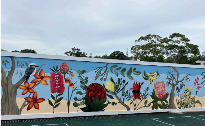
CHS students demonstrate their creativity painting on hoarding

Hoarding is installed around both sites and site sheds have arrived in the staff carpark, with more to come.