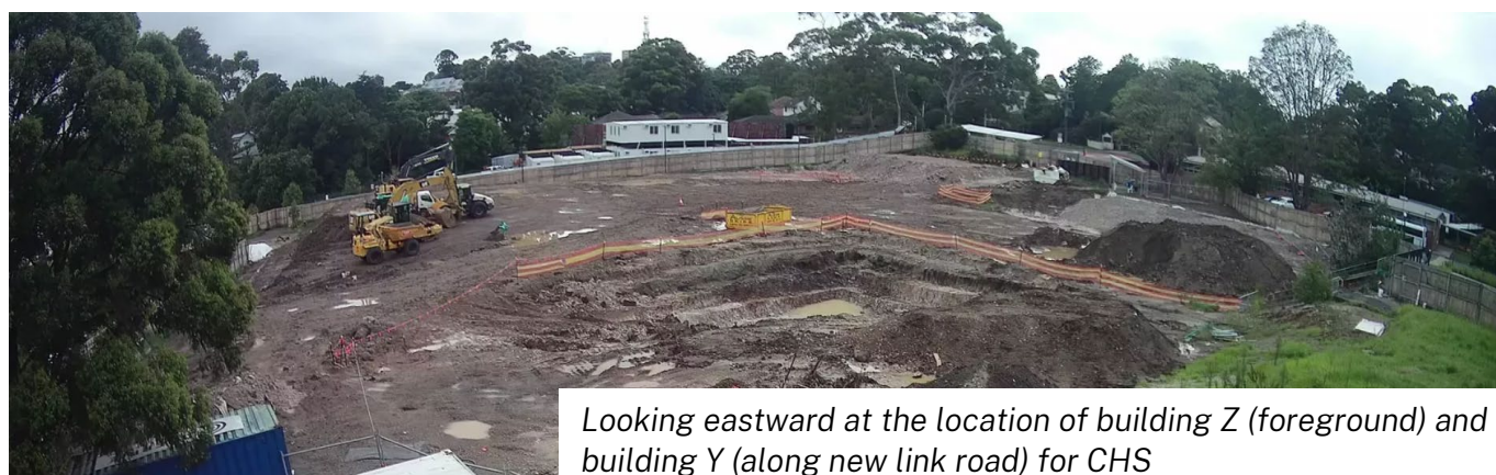
Looking eastward at the location of building Z (foreground) and building Y (along new link road) for CHS