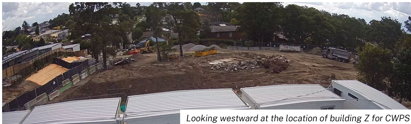
Looking westward at the location of building Z for CWPS