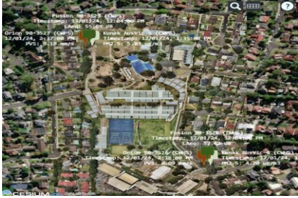
Figure 1: Noise, Vibration and Dust monitoring locations

Equipment: ACOEM Fusion 90-3528 & Fusion 90-3529 Settings: A weighted, Fast, Leq, L10 and L90 and 1/3 octave Calibration Period: IEC 61672-3:2013 Method, Dated: 29/11/2023 Data Samples Resolution: 15 mins