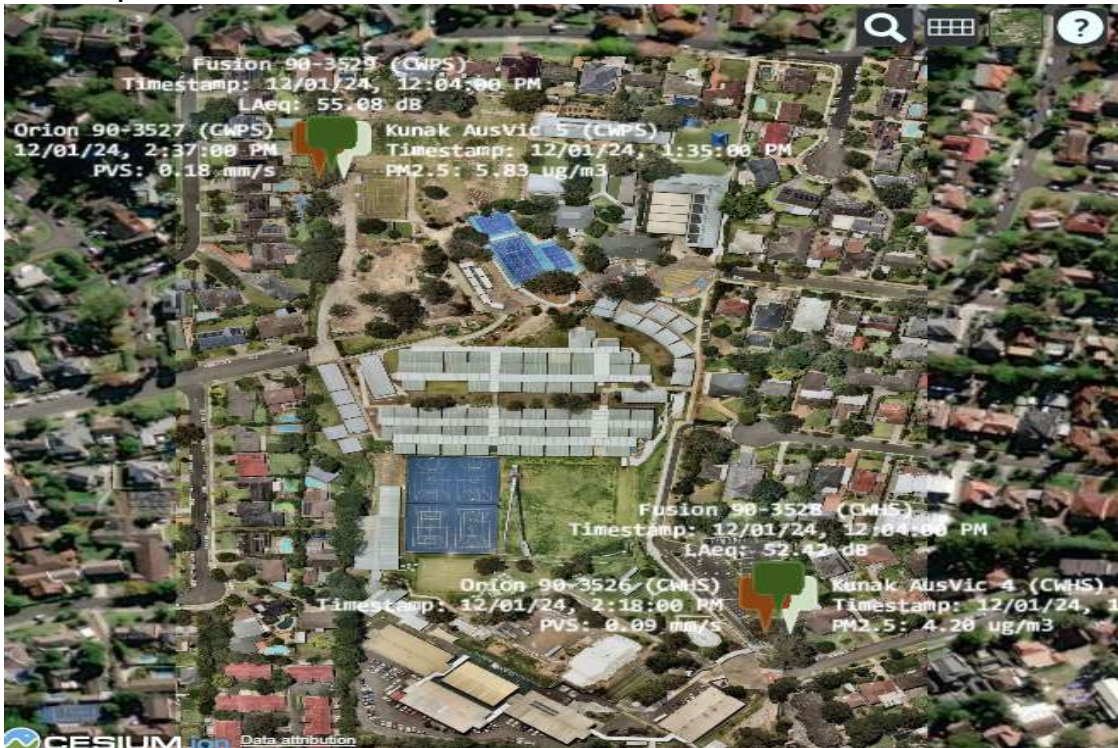
Figure 1: Noise, Vibration and Dust monitoring locations

Equipment: ACOEM Fusion 90-3528 & Fusion 90-3529 Settings: A weighted, Fast, Leq, L10 and L90 and 1/3 octave Calibration Period: IEC 61672-3:2013 Method, Dated: 29/11/2023 Data Samples-Resolution: 15 mins