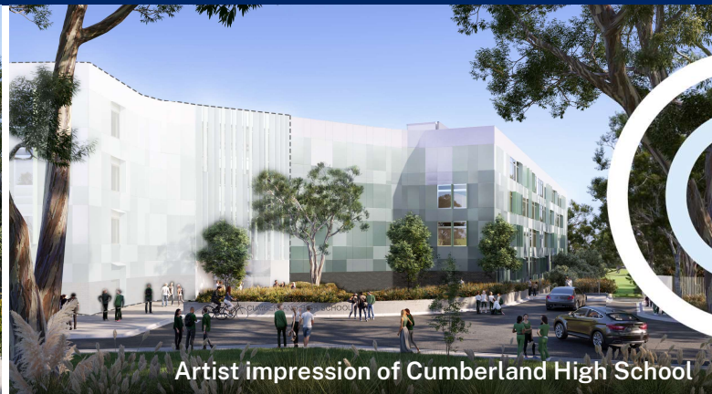
Artist impression of Cumberland High School