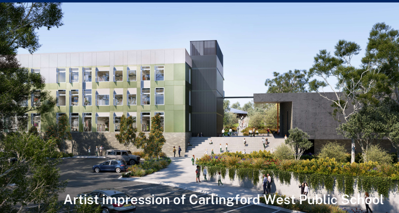
Artist impression of Carlingford West Public School