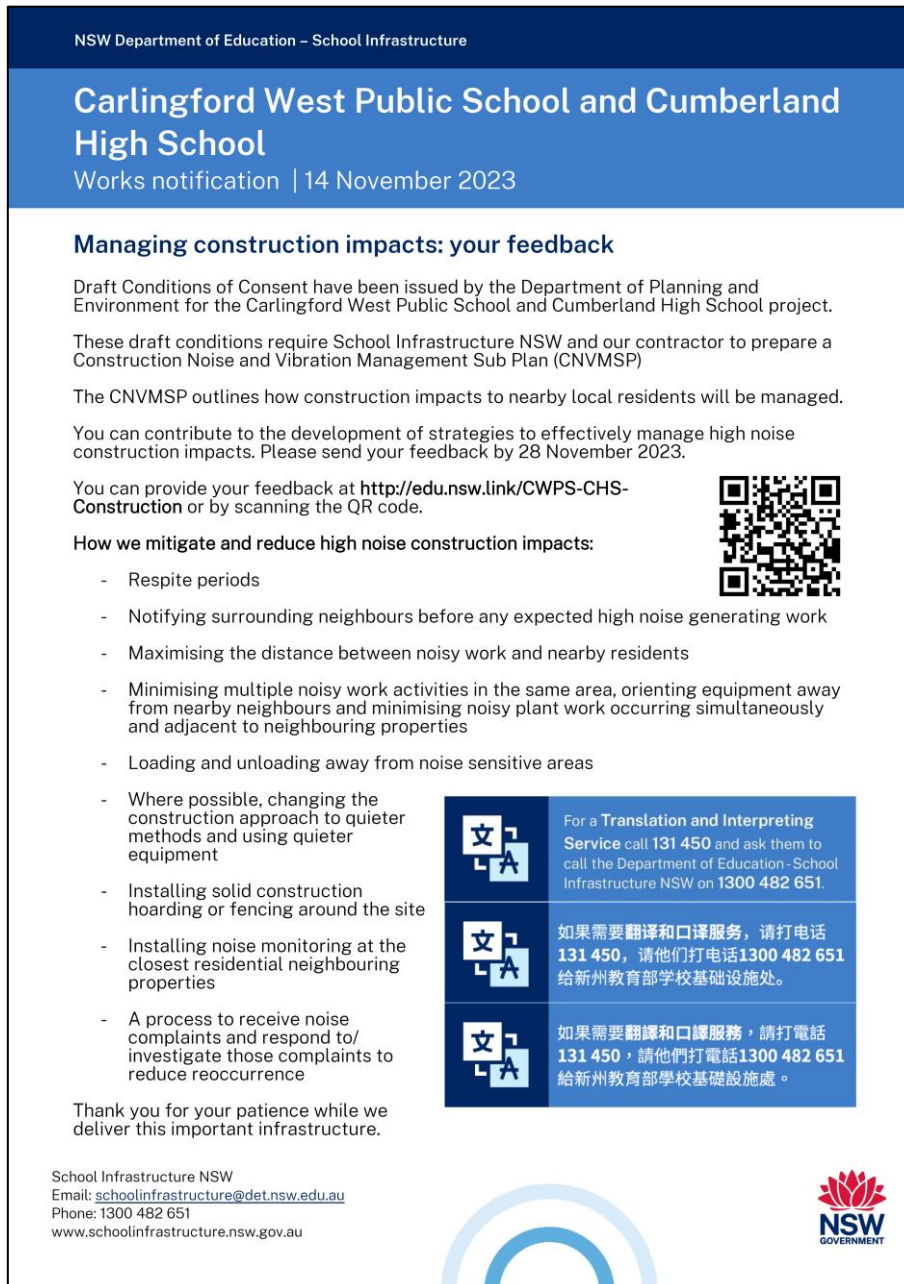
Figure 12 SINSW Works Notification – 14 th November 2023

In response to the letter the following responses were received.