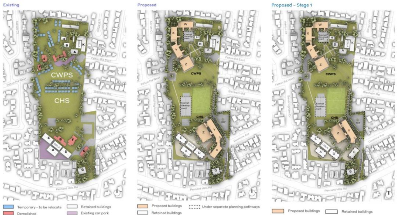
Figure 1 Carlingford West Public School (CWPS) and Cumberland High School (CHS) Upgrades Scope of Project and Proposed Masterplan