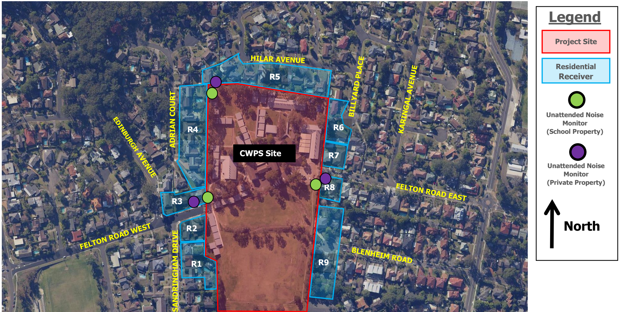
Figure 2 – Site Map, Measurement Locations and Surrounding Receivers Carlingford West Public School (CWPS)