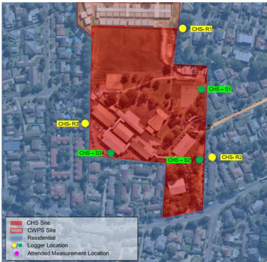
Figure 5: CHS in relation to noise sensitive receivers and noise monitoring locations