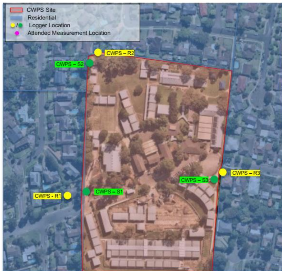
Figure 6: CWPS in relation to noise sensitive receivers and noise monitoring locations