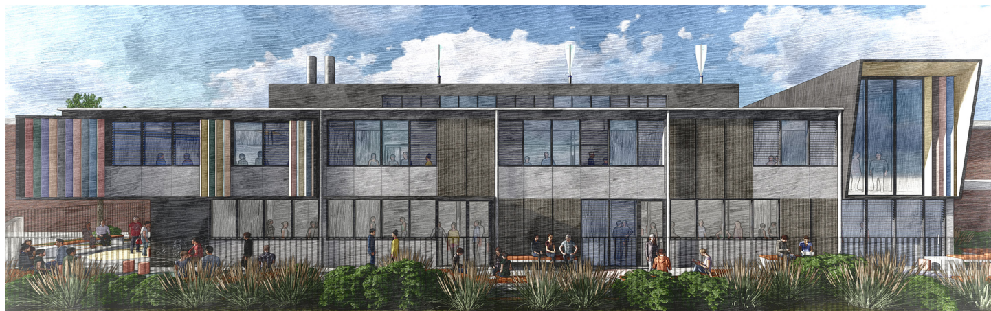
Artist impression of the Canley Vale High School upgrade