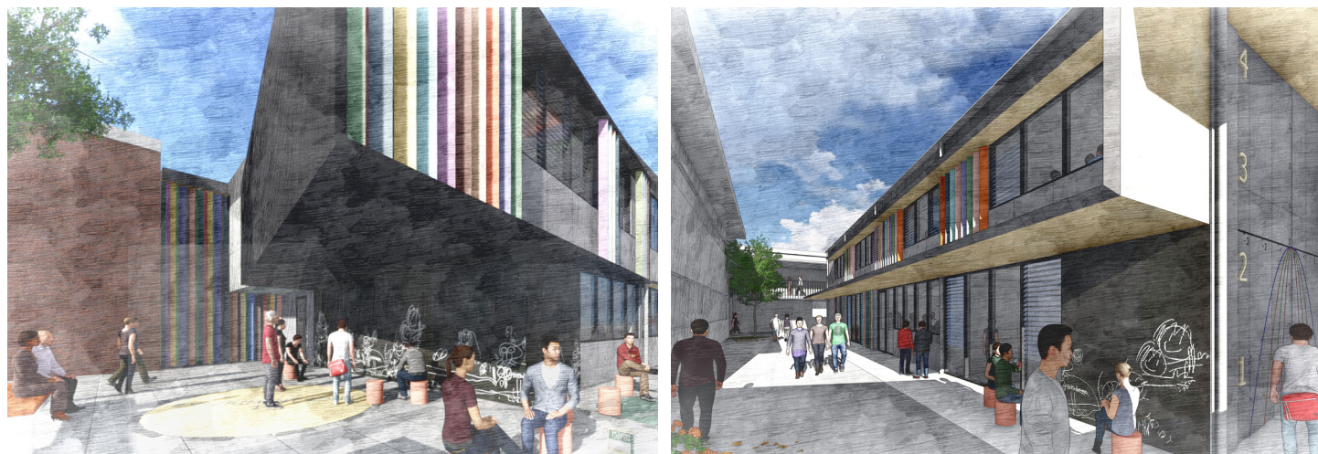
Artist impression of the Canley Vale High School upgrade