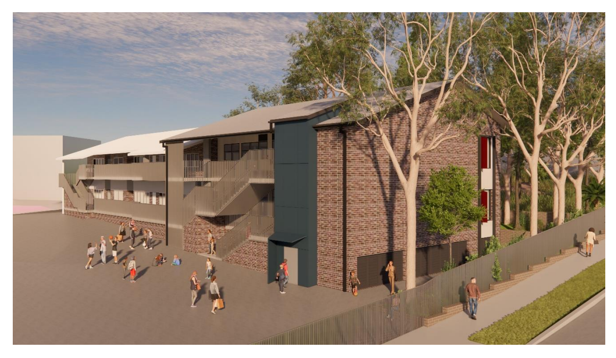
New building with lift (subject to change)