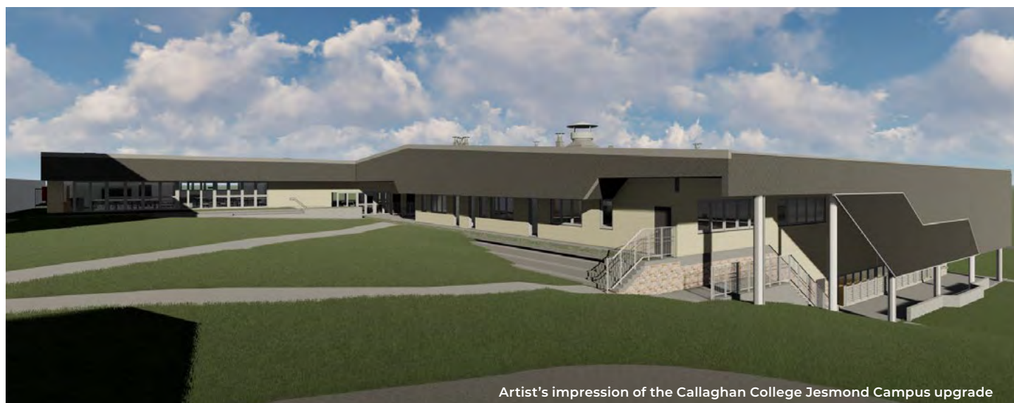
Artist's impression of the Callaghan College Jesmond Campus upgrade